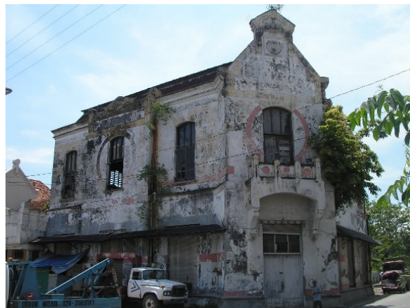
Picture of Spiegel Building In the Dutch Colonial period

Source : https://www.kompasiana.com/christiesuharto/metamorfosa-spiegel-bar-bistro-eropa-lama-di-semarang_56541c39a523bd5d0c7a596a ,