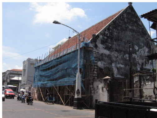
Renovation Picture of Ikan Bakar Cianjur , 2007

After the independence period was used as a private office and dormitory. The building had been vacant for a long time, although it was an important building with a strategic location that became part of the history of the Old Town area. In 2006 the building could be purchased by private parties, before it was renovated to be restaurant in 2007. The former courtroom building was renovated with small changes in the kitchen and side room development.