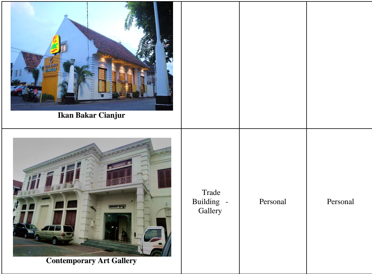
Table Land and Building Ownership Status Table Spiegel Bar and Bistro, Ikan Bakar Cianjur, and Contemporary Art Gallery in Kota Lama