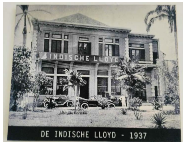
Picture of Contemporary Art Gallery ex. De Indische Lloyd 1937