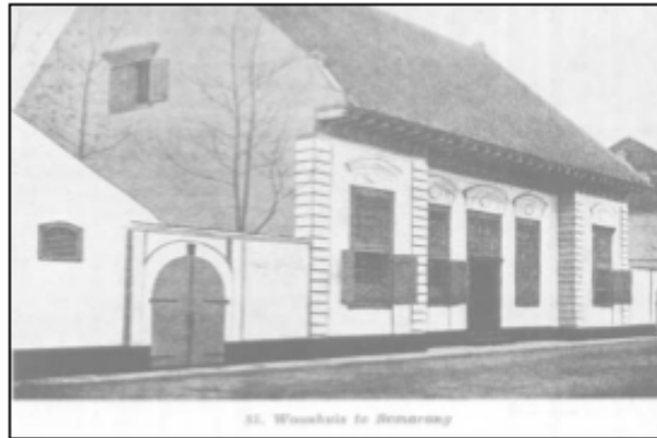
Picture of Ikan Bakar Cianjur Restaurant ex. District Court th. 1925

Building restaurant Ikan Bakar Cianjur on Jl. Lt. Gen. Suprpto of the Old City of Semarang, occupying an old building built during the colonial period in 1760 (Groll, 2004). At first this building served the court office in the colonial period, is a one-story building. The architectural style of this building is an example of a Closed Dutch Style style building similar to Reiner de Klerk's house which currently houses the Archive Building in Jakarta (Groll, 2004 and Heuken, 1997).