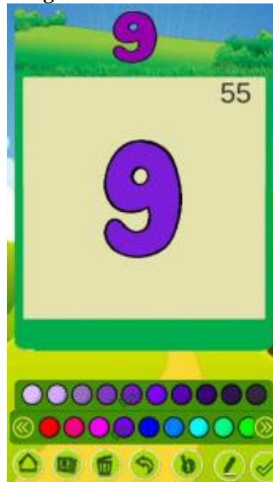
Figure 4.4. Coloring Number