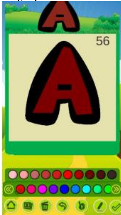
Figure 4.5. Coloring Alphabet