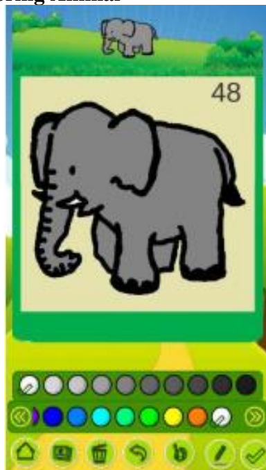
Figure 4.2. Coloring Animal

The choice of receiving animals adds to the knowledge of various kinds of animals ranging from land, air and water.