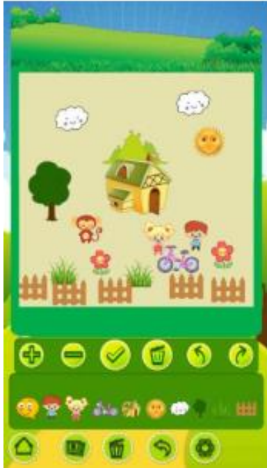
Figure 4.1. Paste The Image