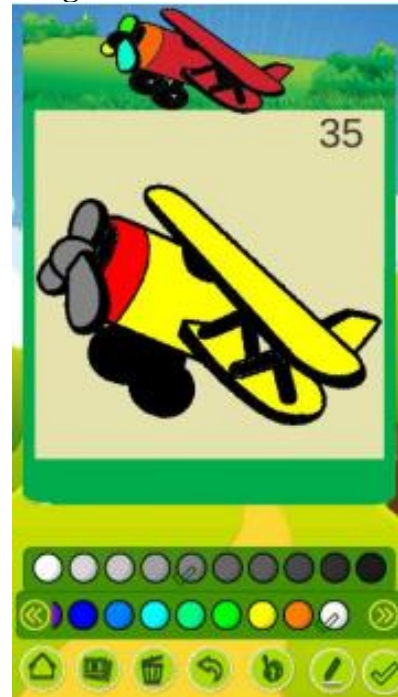
Figure 4.3. Coloring Vehicle

The choice of receiving animals adds knowledge about various types of advice starting from land, air and water.