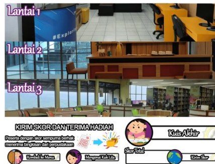
Figure 2. Floor selection UI inside the game

The UI design is using various clip arts from Irasutoya. One of the UI can be seen on Figure 2.