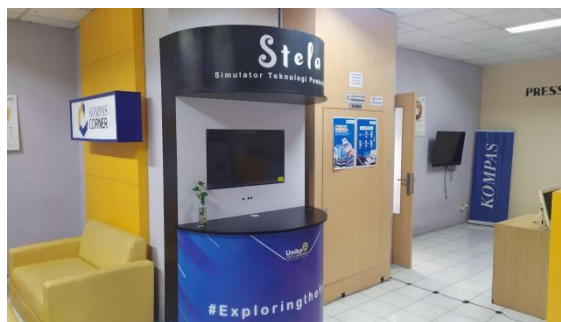
Figure 5. One of the image for “ruang kompas”

Royalty free soundtracks made by shimtone (シムトーン) is used for the background music, few of the musics used for the game are: