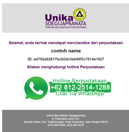
Figure 6. Example of an email being sent to a player

After the player finished all the quiz and reached the maximum score, they can send their name and email to the library’s MySQL database. Afterwards the player will receive an email from an automated address. The example of the email can be seen on Figure 6.