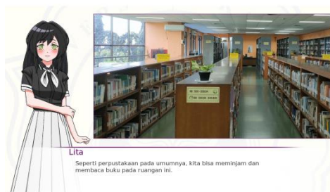
Figure 4. Kak Lita explaining

While listening to the explanation, the players will see various images associated with particular facilities or rooms that are being explained. One example of the photo can be seen on Figure 5.