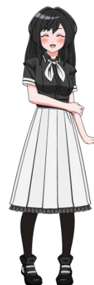
Figure 3. The character of Kak Lita

The explanation will be delivered by “Kak Lita”, the guide for the library tour. The character for “Kak Lita” is derived from an asset made by “CRUG63R” called “Nozomi FREE Customizable VN Character”. the aforementioned character can be seen on Figure 3 and the example of the character inside the game can be seen on Figure 4.