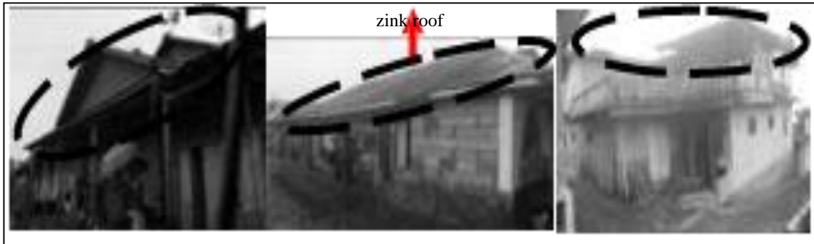
Figure02: Greentech of the use of black zinc material to heat the room in the houses due to the nature with little solar heat