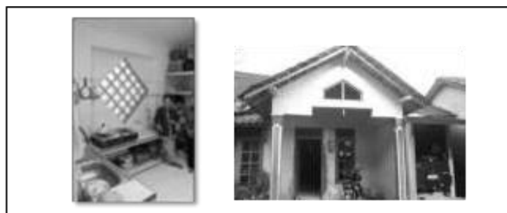
Fig4: Green technology of the utilization of daylight for house lighting through the transparent and the opening of upper wall

In addition for the roof, sunlight can optimally enter through transparent walls, the openings of upper wall, as can be seen in Fig.4 . The sunlight is very useful to the society of Reco sub-village for lighting and heating the rooms in their houses. The followings are the opinions of some residents of Reco sub-village gathering at the time of FGD on the matter. Some creativities applied by Reco villagers in the utilization of sunlight into buildings, such as through the top hole, installing glass window, glasstile with the strategy that the glasses made are dead glasses so that the entering heat does not easily come out.