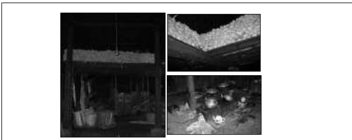
Figure1: the position of black tin, pogo, and stove as the green technology of preserving food stuffs.

Green tech Based on Solar Heat for Preserving Food stuffs can be found in some observed villages including in the villages of Kapencar, Candiyanan, and Reco. Most of the staple food in the villages on the slope of mountain with the altitude of 1000 meters above the sea level is corn. Many homes in the mountain slopes have a room specifically to store and preserve corn called pogo , namely the space above the stove of pawon and tin roofed. Pogo existence is always under black tin roof with the intention that the hot sunlight on the roofs of the houses can be absorbed by the black tin and channeled down in order to heat the corns stored in pogo . The existence of pogo above the kitchen stove can also help corns be preserved from the bottom so that the corns are heated from two directions; from the bottom in the form of the kitchen stove and from above in the form of zinc roof (show in Fig 1 ). According to the people and the results of the field measurements, the effective distance to get the heat of the furnace of pawon is \pm 2-2.5 meters and 1-1.5 meter from tin roofing. Yet, according to the information from some residents who joined the FGD, the position of pogo for the most optimal drying for corns is indeed on the stove of pawon and under the black tin roof. Pawon position is above and below the tin roof to heat the corns so as to remain stable in good condition for 2 years (the people information in FGD, 2014).