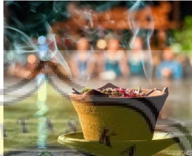
Figure 4.14 kemenyan

Kemenyan or incense is the media for sending prayers about the well being of the baby and its future. Simultaneously with the smoke rising up from burning the kemenyan , there is hope that the spirits will help and not disturb the baby (Suharsono, 2018).