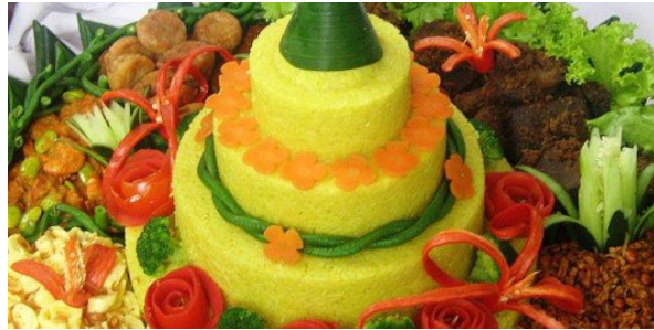
Figure 4.6 The dish of tumpeng