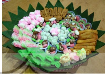
Figure 4.12 jajan pasar

7) Jajan pasar is a menu made of different kinds of traditional snacks snacks. The variety of jajanan pasar symbolizes the substance the baby in the future.