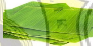
Figure 4.7 Godong pisang