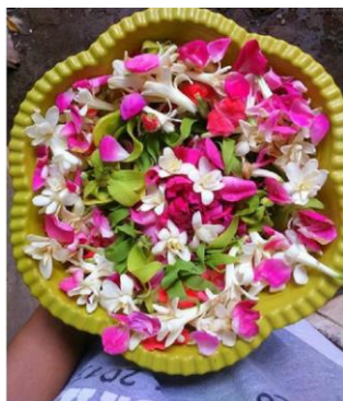
Figure 4.13 kembang telon

Sofianita (2018) explains that kembang telon are flowers, which consist of white and red roses, jasmine, magnolia flower, and ylang flower). The red color on the roses symbolizes human that is created from the mother's red blood. the white color on magnolia symbolizes that humans come from white and clean water, which represents the father. Meanwhile, the ylang flower symbolizes the achievement, a child should be able to do in imitating the goodness an ancestor of the parents.