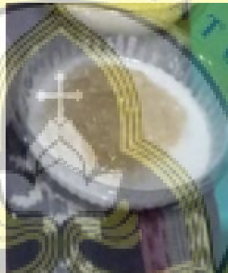
Figure 4.9 The dish of the baro-baro porridge