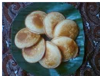
Figure 4.8 Apem