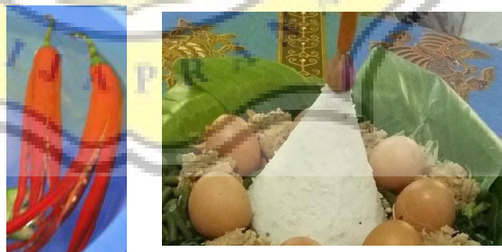
Figure 4.2 The red onion and red chilli on top of a tumpeng

To celebrate Selapanan , the host usually invites neighbors and close relatives. Starting in the afternoon and before the hair and finger-nail cuttings, the host will prepare meals ( bancaan ) and distribute them to the relatives and children around the house. “With bancaan , the baby, i.e. the family, share happiness for those living around him” (Setyaningtyas, 2018). The required bancaan are nasi tumpeng with vegetables, jenang merah putih , jajan pasar , and boiled eggs. An offering ( sesaji intuk-intuk ) is placed near to the baby’s bed. Intuk-intuk is a small tumpeng wrapped with banana leaves, with red chili and onion at the top.