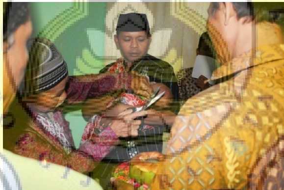
Figure 4.4 Baby haircut

the baby will grow healthy in the future. The baby's hair should be cut or shaved completely clean. It is believed that the baby's original hair is already exposed to the amniotic fluid, so the baby hair must be shaved off. Another reason for shaving the baby is so that the hair can grow healthier and nicer in the future (Setyaningtyas, 2018). However, some people do not cut their baby's hair completely bald. The hairs are only trimmed for it is merely a symbolization. Shaving the baby's hair should be done carefully considering that baby's skull is still vulnerable to hard objects. In order to protect the baby from accidents, the baby is held in order to prevent its making unnecessary movements. The baby is usually made into a sleeping position. This makes it more comfortable for the baby and the person cutting the hair.