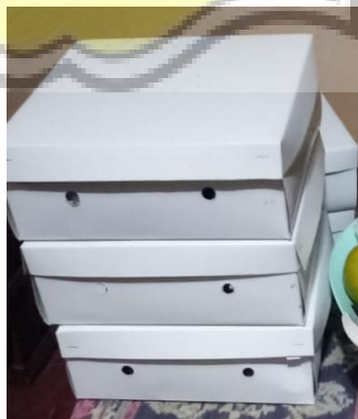
Figure 4.11 Kenduri or bancaan