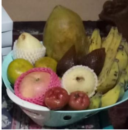
Figure 4.10 Some food which grow hanging on trees