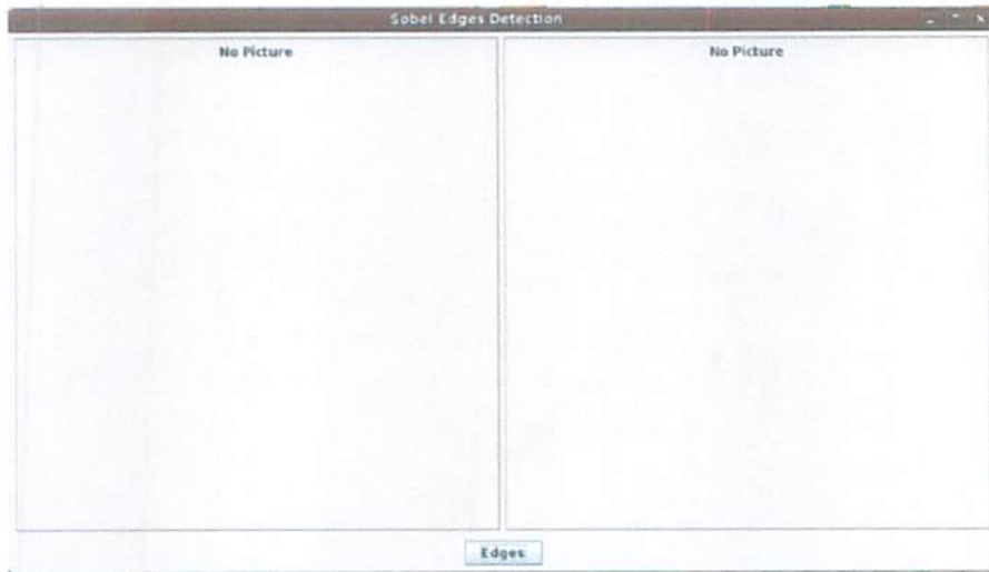
Figure 5.1 Application Interface

The button Edges use for execute program to process image with sobel detection, after user input matrix, path image, and value sobel. Output GUI is contains of the original image and image after edges detection.