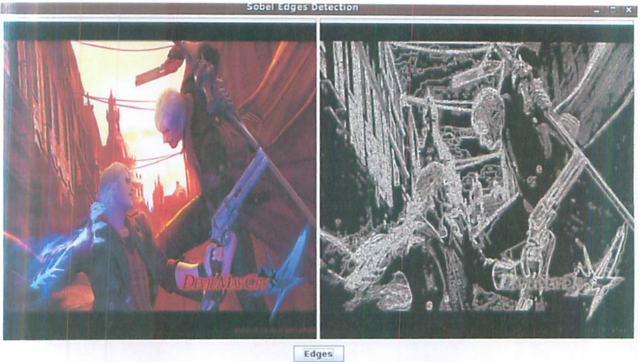
Figure 5.3 Result Sobel Matrix 5x5

This is result image after process sobel edges detection with matrix 5x5. It can be seen that the image in the form of edge more visible then process with matrix 3x3, image objects more visible and more detail. After process edges detection object in the image can be easier to recognize.