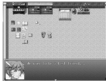
Fig 1. Past Continuous Sentence Example

Games for learning English programmed so that the players could finish quests that required the players to learn English. These quests can be related to grammar or vocabulary learning.