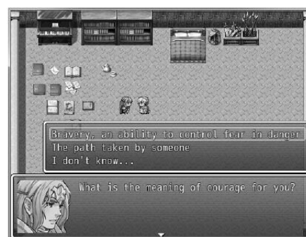
Fig 3. Vocabulary Related Question Example

Besides sentences, players could also be given quest questions related to grammar. (Fig 2)