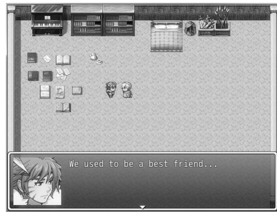
Fig 1. Past Continuous Sentence Example

Games for learning English programmed so that the players could finish quests that required the players to learn English. These quests can be related to grammar or vocabulary learning.