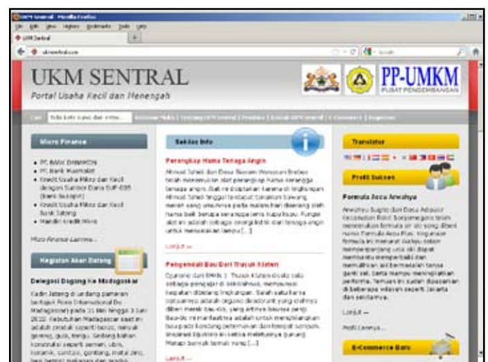
Fig. 1: Web Portal of SMEs Gives Impact in Wider Networking for the Community

At another example "The integration of Creative Industry Based on Information Technology and Community's Participation to Empower the Art Creative Industry", empowerment of the art community of puppet that poor financially through social media is needed to attract more audiences, event organizers, and opportunities in business of accessories. The need to show their capability, open the wider networking, and increase the coverage of promotion to emphasize their potency can be solved by providing the community web which able to encourage the participation of actor, fans, and people who care. The underprivileged community is able to get the better positive opportunities by involving in this effort. The innovative approach to deal the complex social needs is one of characteristic of social entrepreneurship [4].