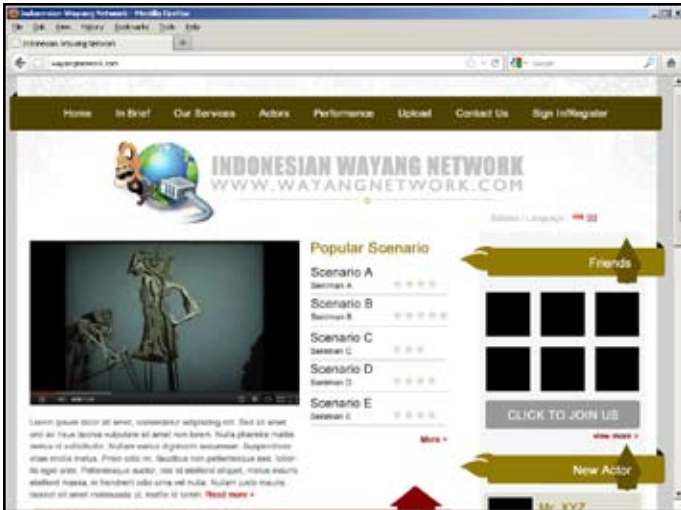
Fig. 2: Community's Web Portals to Open More Opportunity for the Community

The two examples above demonstrate the effort to use the Information Technology as a tool for entrepreneur in reating the wider opportunities involving the participation of disadvantages communities. Those two approaches of IT utilization in order to empower the poor communities can be used to enhance the service learning in creating the spirit of Social Entrepreneurship [3]. Students have the opportunity to learn the entrepreneurship spirit for helping others.