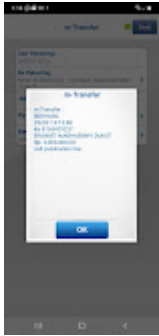
bukti transfer celt.jpeg 52K