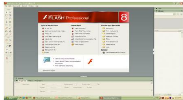
Fig. 1 Early Macromedia Flash Picture Display

The first display when we open the Macromedia Flash Version 8 is: