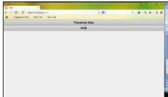
Fig 4. Main Menu Option

Display of this menu can be seen in Fig 4.