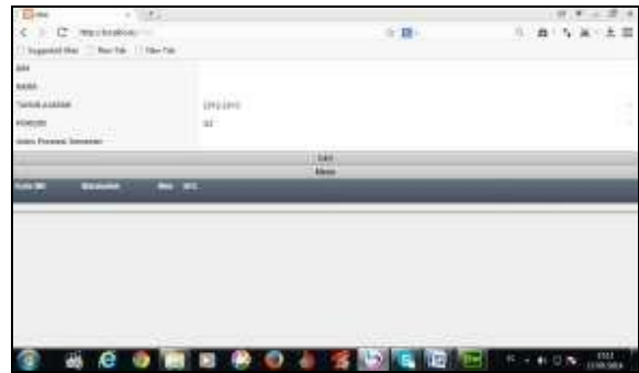
Fig 5. Menu Display for KHS

Inilai.kd_msuji FROM tabelnilai where tabelnilai.nim=" 'x2'. "" order by tabelnilai.nim,tabelnilai.kdmk_jur") or die (mysql_error()); $totaldata = mysql_num_rows($result); } else { $result = mysql_query ("SELECT tabelnilai.nim,tabelnilai.kdmk_jur,tabelnilai.nm_mkul iah,tabelnilai.nilai,tabelnilai.sks,tabelnilai.thnajar,tabe lnilai.kd_msuji FROM tabelnilai where tabelnilai.nim=" ".$nim1. "" and tabelnilai.thnajar=" .substr($thnajar1,0,4). "" and tabelnilai.kd_msuji=" .$periode1. "" order by tabelnilai.nim,tabelnilai.kdmk_jur") or die (mysql_error()); $totaldata = mysql_num_rows($result); if ($totaldata == 0 ) { $result = mysql_query ("SELECT tabelnilai.nim,tabelnilai.kdmk_jur,tabelnilai.nm_mkul iah,tabelnilai.nilai,tabelnilai.sks,tabelnilai.thnajar,tabe lnilai.kd_msuji FROM tabelnilai where tabelnilai.nim=" 'x2'. "" order by tabelnilai.nim,tabelnilai.kdmk_jur") or die (mysql_error()); }; } if ($totaldata > 0 ) { while ($row=mysql_fetch_array($result)) { $data5[] = array( "nim" => $row[0], "kdmk_jur" => $row[1], "nm_mkuliah" => $row[2], "nilai" => $row[3], "sks" => $row[4], "thnajar" => $row[5], "kd_msuji" => $row[6] ); $data5++; } } else { $data5[] = array( "nim" => "", "kdmk_jur" => "", "nm_mkuliah" => "", "nilai" => "", "sks" => "", "thnajar" => "", "kd_msuji" => "" ); } echo json_encode($data5); ? >