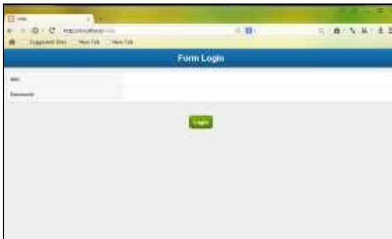
Fig 2. Login Display

Display of this log can be seen in Fig 2.