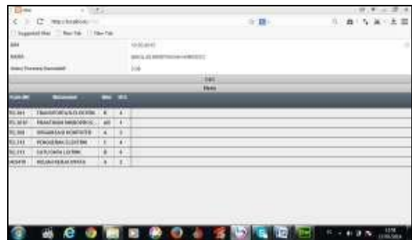
Fig 8. Display Results in the Programs Menu Transcript

If we fill the NIM 10.50.0015 as an example to look for GPA, then the result can be seen in Fig 8.