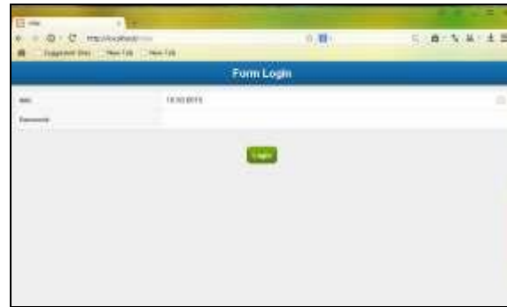
Fig 3. Example of Inserting NIM at Login

Login NIM student is used, because it is not probably the same NIM between students with each other. NIM filled with the data nim that already exists, for example 10.50.0015, the results can be seen in Fig 3: