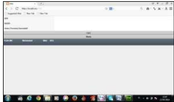
Fig 7. Display the Menu Transcript

Display menu transcripts can be seen in Fig 7.