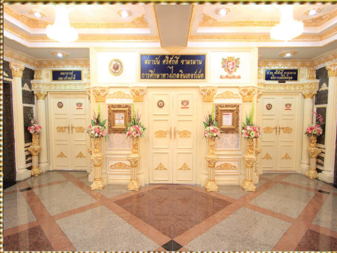
Front Door of Srisakdi Charmonman Institute