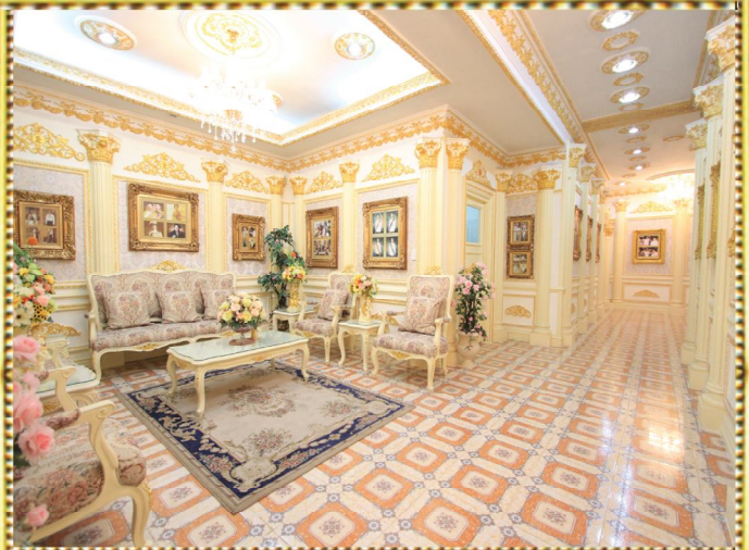
The Lobby of Srisakdi Charmonman Institute