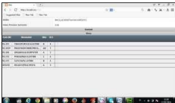
Fig 6. Results for Program Menu NIM 10.50.0015 at KHS

In Fig 5, if the NIM is filled with 10.50.0015, and selected school year as well as the period selected G2 201 202 013 (even), then clicked search, it is also the name of an IP automatically next semester will be filled, as in the view Fig 6.