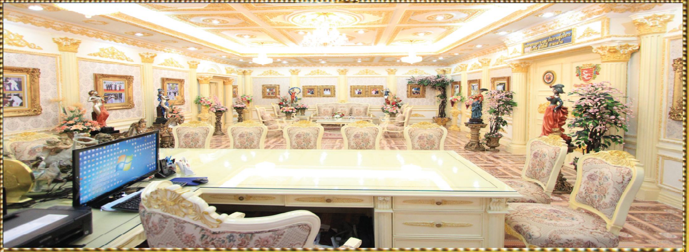
Siam Technology Press, Srisakdi Charmonman Institute, Siam Technology College