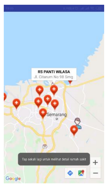
Figure 4.3 Map

Map: In the map menu, users can find services that provide medicine in the city of Semarang.