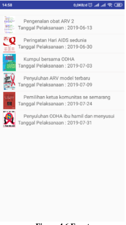
Figure 4.6 Event

Event: this menu displays events that will be held by the community or hospital.