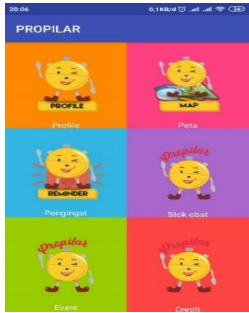
Figure 4.1 Menu

Profile: In the profile menu the user can view the data themselves and edit the data themselves.