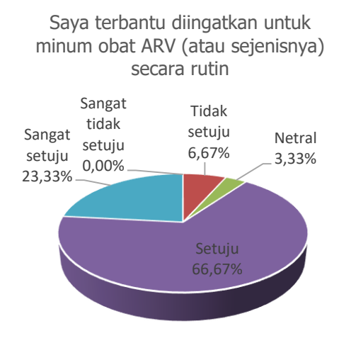
Figure 4.8 helped to be reminded to take ARV regularly

According to 63.33% of respondents strongly agree if the application helps remind when antiretroviral drugs or the like will run out. A total of 26.67% of respondents agreed if they were helped to be reminded when antiretroviral drugs would run out. And according to other respondents as many as 3.33% of respondents stated strongly disagree, disagree, and neutral.