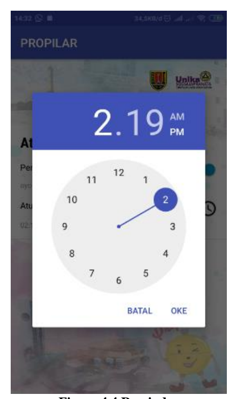
Figure 4.4 Reminder

Reminder: In the reminder menu, users can set the hours for notifications to take medication.