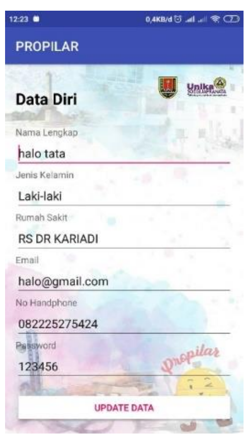
Figure 4.2 Profile

Profile: In the profile menu the user can view the data themselves and edit the data themselves.