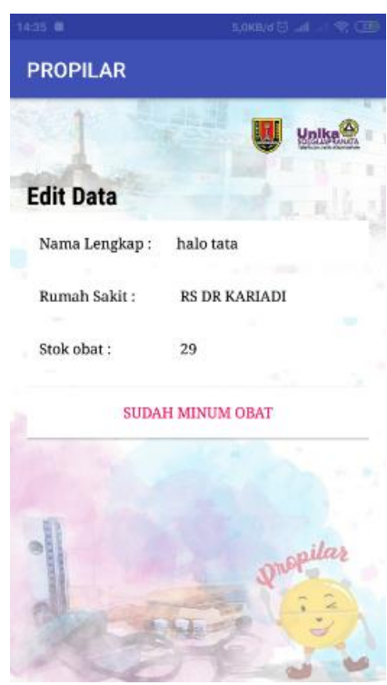
Figure 4.5 Stock

Event: this menu displays events that will be held by the community or hospital.