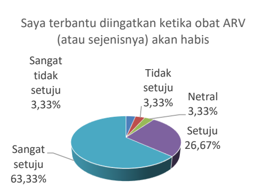
Figure 4.7 helped reminded the drug will run out

Based on 30 respondents who have filled out the questionnaire, the results are obtained