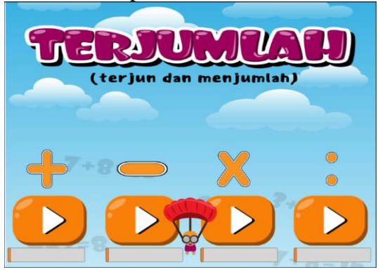
Figure 6 Main menu Display

The main menu is a display where the user selects the arithmetic operation will be done when in the game. There are four choices of counting operations to choose from: sum, subtraction, multiplication and division.