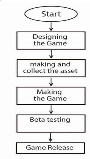
Figure 1. Flowchart game creation

In the game-making stage begins with the designer and the concept of the game to be created. Followed by the process of making game assets such as pictures, packages, as well as some supporting assets. When the game asset design is considered appropriate then the next stage is the stage of making the game. At this stage the assets that have been made are combined and added programming scripts. When the merging process is complete, beta testing begins, to ensure no bugs in the game are made. Once it has been confirmed there are no bugs, the game is ready for release.