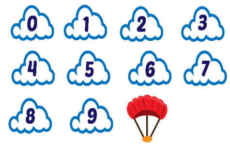
Figure 2. Cloud and parachute assets

In the making of games required assets. Assets are all materials needed in the making of games, such as pictures, sounds, programming scripts, and others.