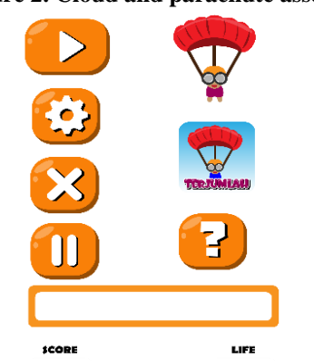
Figure 3. Button and icon image assets