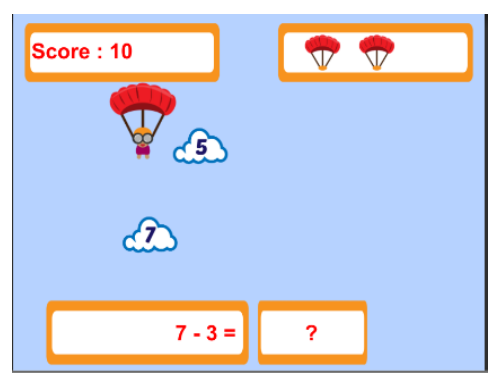
Figure 7. Gameplay display

In accordance with the title and theme, this game invites users to learn mathematics, as well as doing fun activities.