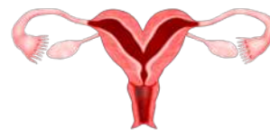
Gambar ( Times New Roman 12)