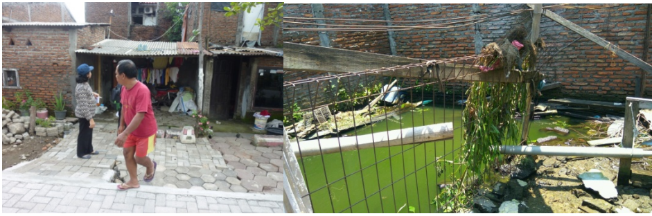
Figure 2 : Mrs. Hanifah's house (a) front view (b) the yard inside the house

Mrs. Hanifah's house was one of the houses which was not raised. The house floor was lower than the street.