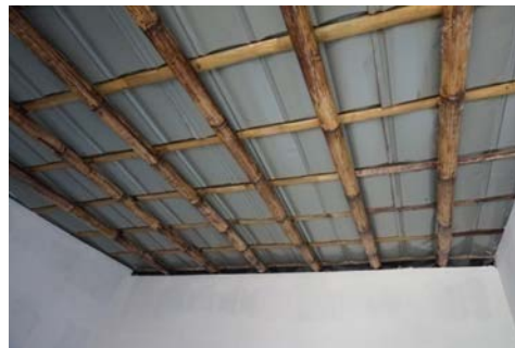
Figure 11 : a)Window for lighting b) Wall cover of calciboard; rafter and batten of preserved bamboo

The presence of inner walls made of calciboard is expected to be painted with a color that suits the taste of the occupants,so it is more comfortable to live in. The shape of the roof is lasenar with the roof angle of 16 degrees. The shape was chosen in order that the implementation and construction of the stage house is quite easy and efficient. The houses has no ceiling so that the cost of building and construction is lower. However, in the absence of ceiling,it makes the inner space rather hot during the day because there is no air space between the roof and the room. For roofing materials (metal roof),it is made of metal and asphalt that causes solar thermal radiation propagate into the house/ space. The roof materials were chosen because it is relatively light and reasonably priced.