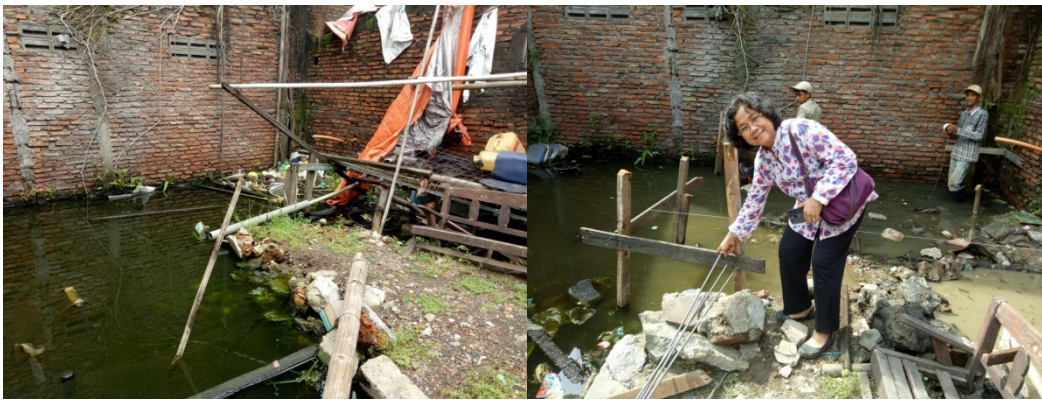
Figure 3 : The location of the stage house to be built in the yard inside Mrs. Hanifah's house.

Mrs. Hanifah's house was one of the houses which was not raised. The house floor was lower than the street.