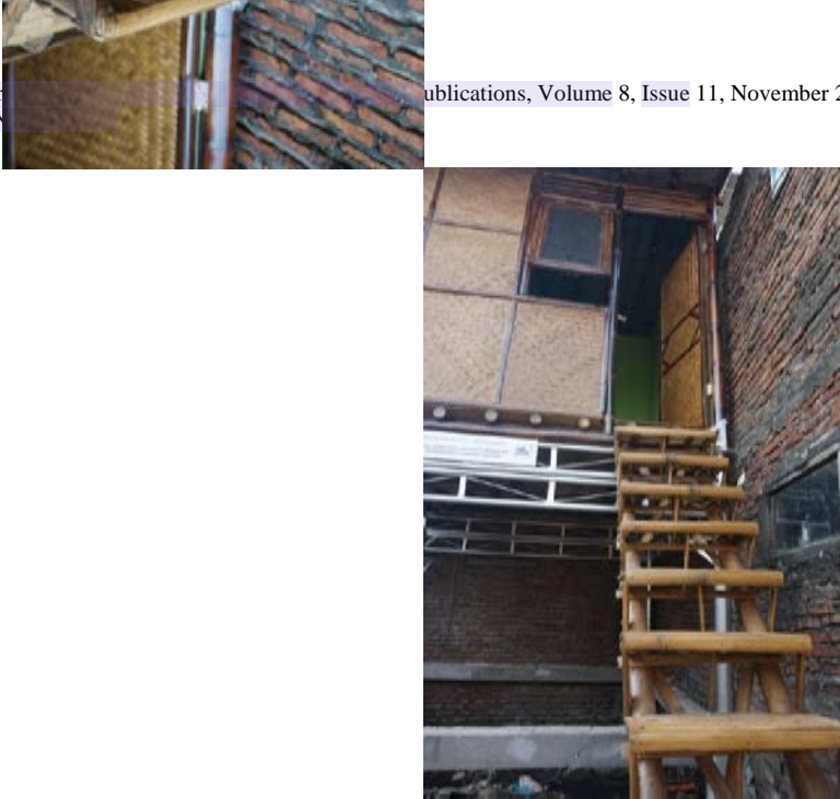
Figure 6 : The stairs to the stage house made of bamboo