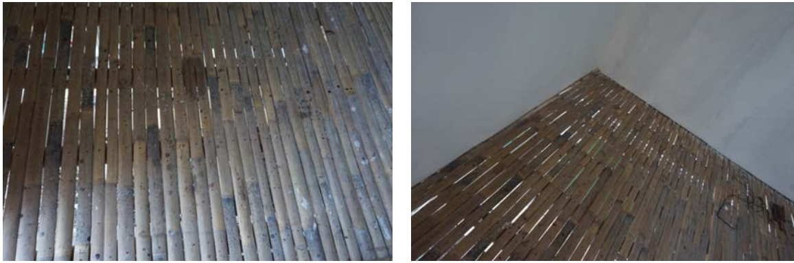
Figure 10 : the stage house's floor;preserved bamboo blades were used