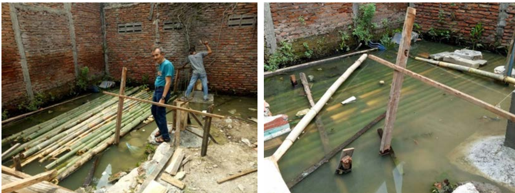
Figure 7: The soaking of bamboos in tidal pond

For the rafter, the bamboo with the diameter of 8 centimeters was used, and for the batten, bamboo blades were used and made by the people in a mutual cooperation.