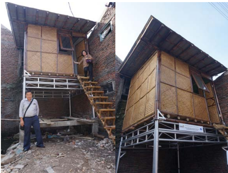
Figure 9: Outside view of Mrs' Hanifah's stage house looks natural because the building materials are dominant with bamboo.

For the appearance/ facade of the whole stage house building made of bamboo, it was finished using brown varnish, which did not change the natural color of the bamboo. This bamboo stage house can be seen from the front side of Mrs. Hanifah's house, so it is quite a contrast with the surrounding houses. Natural impression appears in an area that is friendly to nature in the area dominant with water.