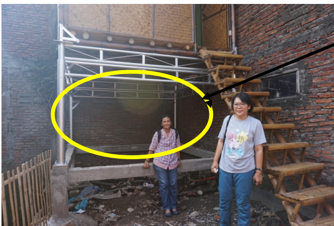
An empty space under the stage house

The presence of the stage house of 1.5 meters higher from the ground level was useful as the empty space under the floor could be used for other activities, such as sitting around while chatting and relaxing. It can be done when there is no tidal flood.