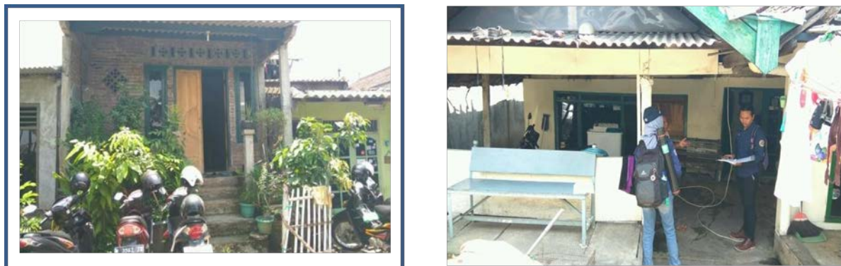
Figure 1: a/left ) A house with raised floor level (Mr. Mahdi's house), b/right) a house without the raising of floor level (Mr. Bambang Susilo's house)