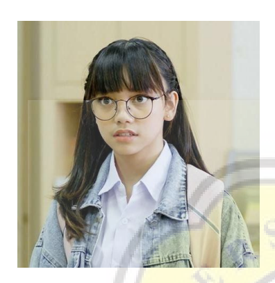
Figure 4.1 The physical appearance of Fara

Note: (My N<mark>erd Girl 0:</mark>7:38 EP 01)