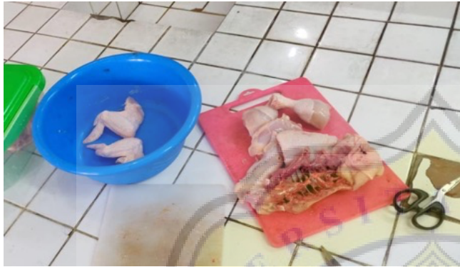
Lampiran 16. Uji Penelitian Parameter