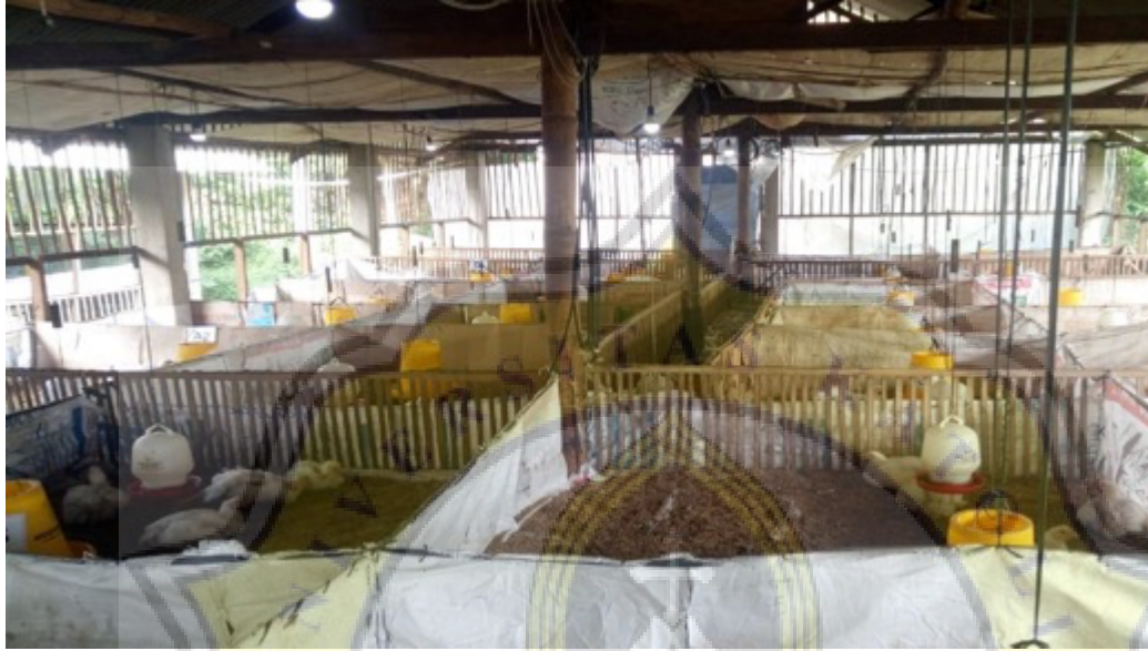
Lampiran 13. Kandang Ayam Broiler