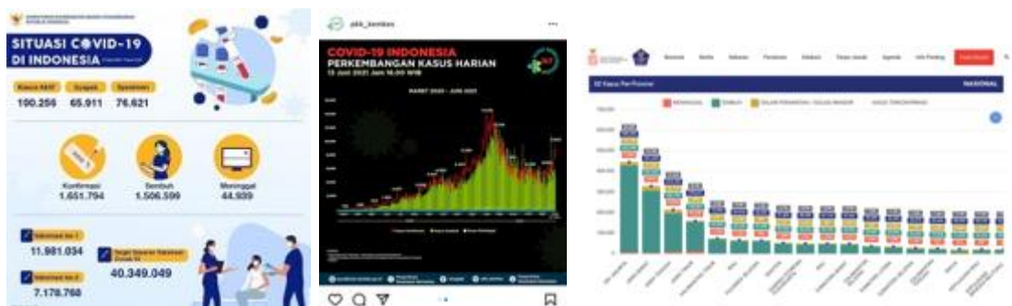
Figure 1. (Left-Right) Example of Statistical Infographic, output of the Coordinating Ministry for Economic Affairs of the Republic of Indonesia, the output of the Health Crisis Center of the Ministry of Health (PKK Kemkes), and a graph of case data per province issued by the COVID-19 Task Force.