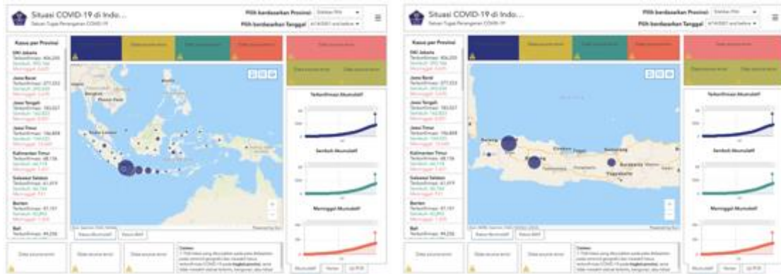
Figure 5. (Left-right) Example of an infographic with Zooming format issued by the Ministry of Tourism and Creative Economy.