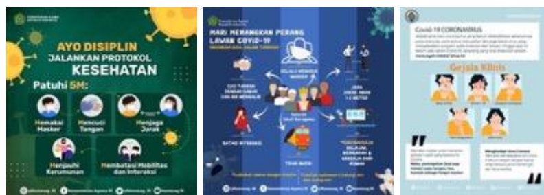
Figure 4. (Left-right) Example of an infographic in Static format from the Ministry of Religion and the Ministry of Villages, Development of Disadvantaged Regions, and Transmigration of Indonesia.