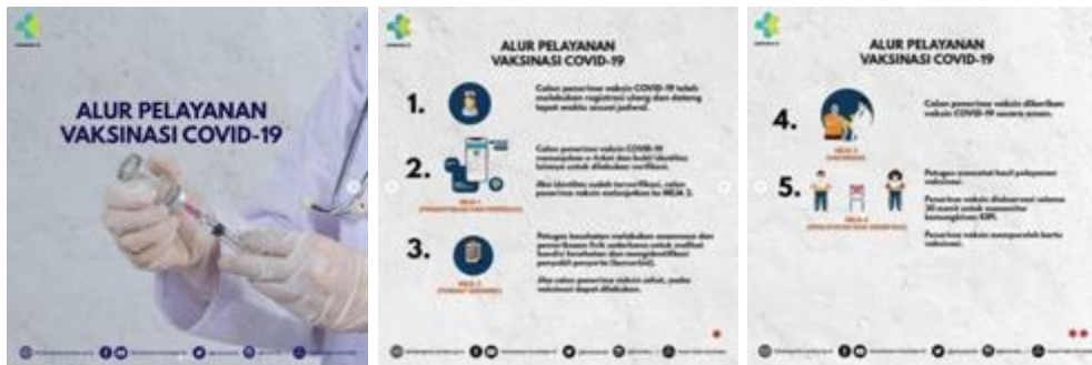
Figure 2. (Left-right) Example of a Process Based Infographic issued by the Ministry of Health regarding the flow of COVID-19 vaccination services uploaded on the Instagram page in the form of a slide upload.

A Process-Based Infographic is an infographic that represents a workflow process or activity flow in a specific environment, such as a vaccination room workflow or an activity flow from one workspace, office, or factory to another. Process-Based Infographic above, the context of this discussion is an infographic that describes the flow, stages, or processes in receiving COVID-19 vaccination for Indonesian people, from one room to another, from one table to another, or from one stage to another.