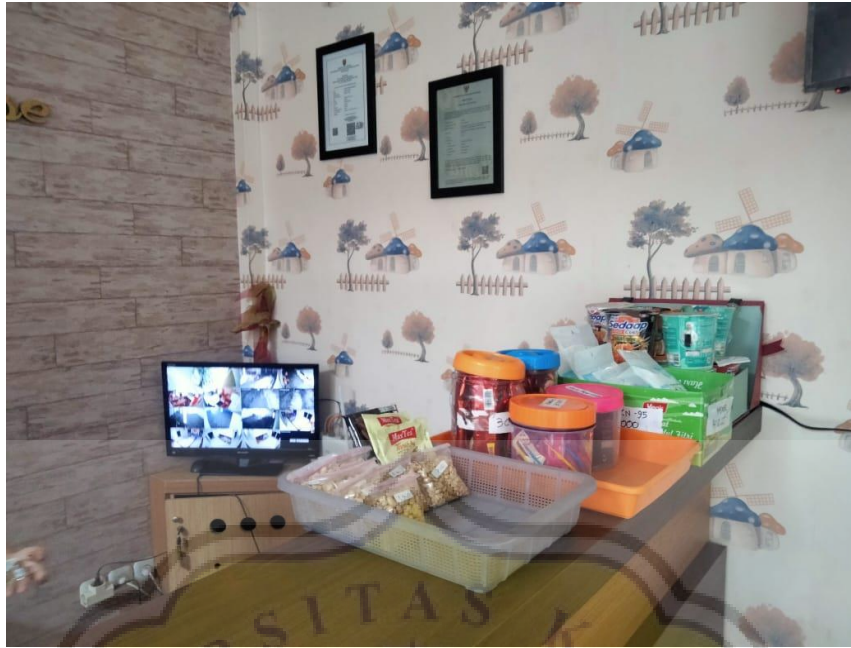
Gambar 9 Aset Fisik Fasilitas CCTV dan Snack di Rhema Guesthouse