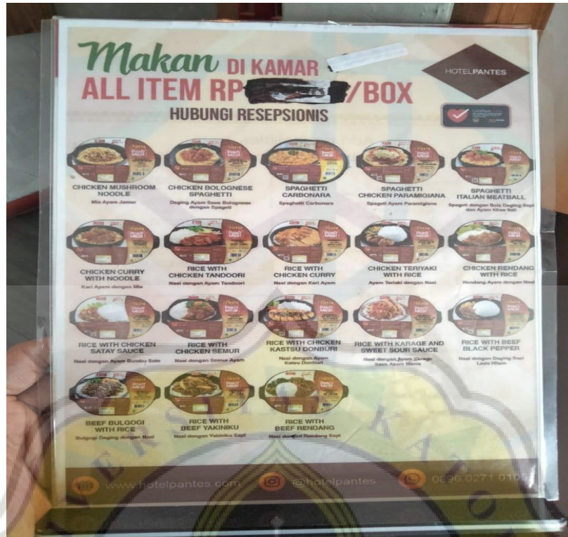
Gambar 7 Aset Fisik Menu Sarapan yang Beragam di Pantès Residence