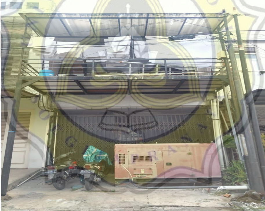
Gambar 4 Aset Fisik berupa cadangan listrik (genset) di Tjiang Residence