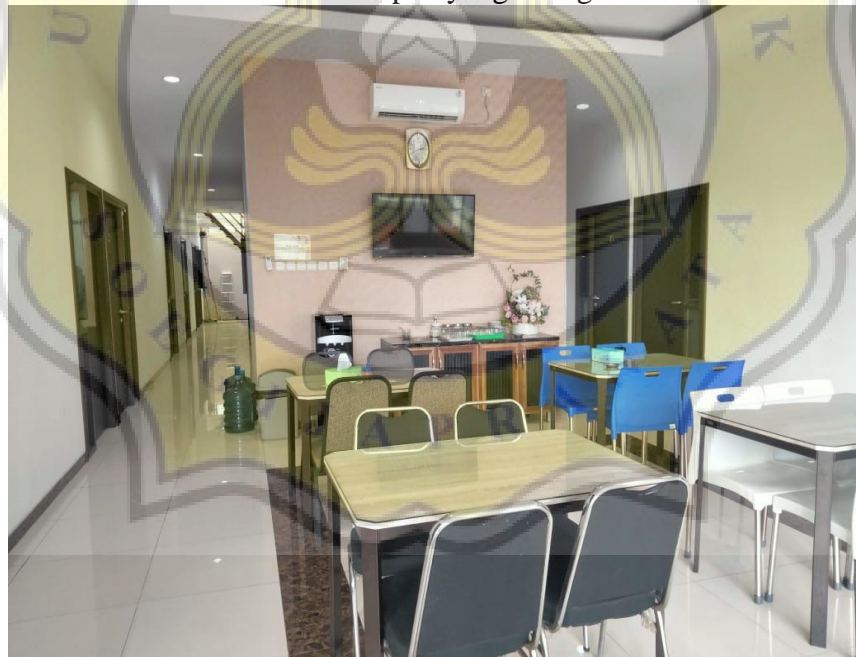
Gambar 8 Aset Fisik Fasilitas Breakfast Space di Rhema Guesthouse