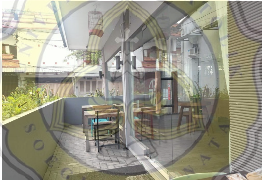
Gambar 6 Aset Fisik berupa Smoking Area di Panties Residence