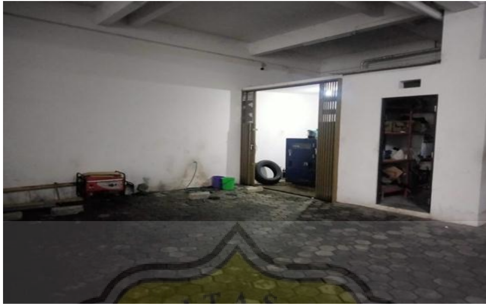
Gambar 5 Aset Fisik Berupa Cadangan Listrik ( Genset ) di Rhema Guesthouse