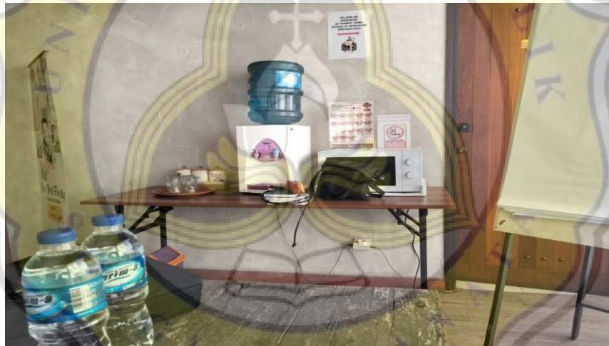
Gambar 2 Fasilitas Microwave yang ada di Hotel Pantès Pecinan