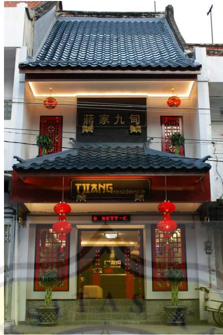
Gambar 3 Tampak Muka Tjiang Residence