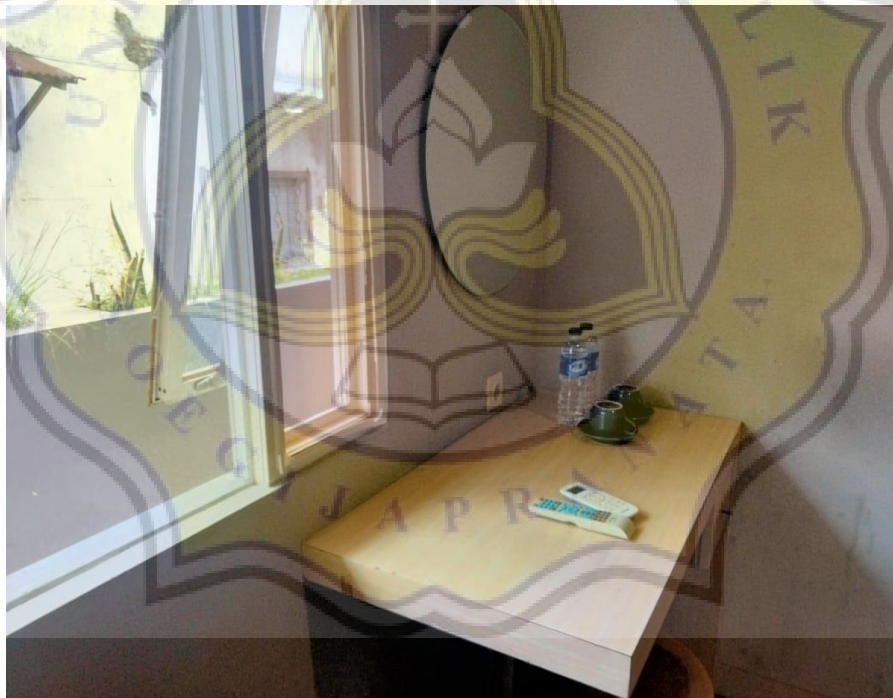
Gambar 10 Aset Fisik Berupa Ventilasi di Kamar Pantess Residence