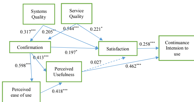
Fig. 2. The final model after testing. *p < 0.05, **p < 0.01, ***p = 0

From table 8, it can be seen that all the hypotheses are support, except for H4a not support because the P value is above 5% or 0.05. The following is a picture of the model after testing the hypothesis.