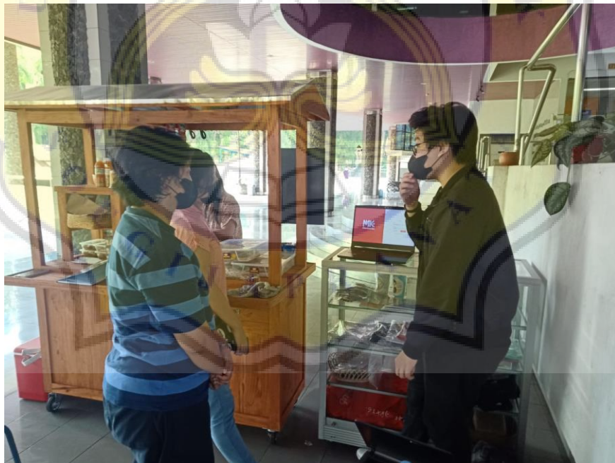
Gambar B.2 Dokumentasi Uji Coba Aplikasi MentorKu