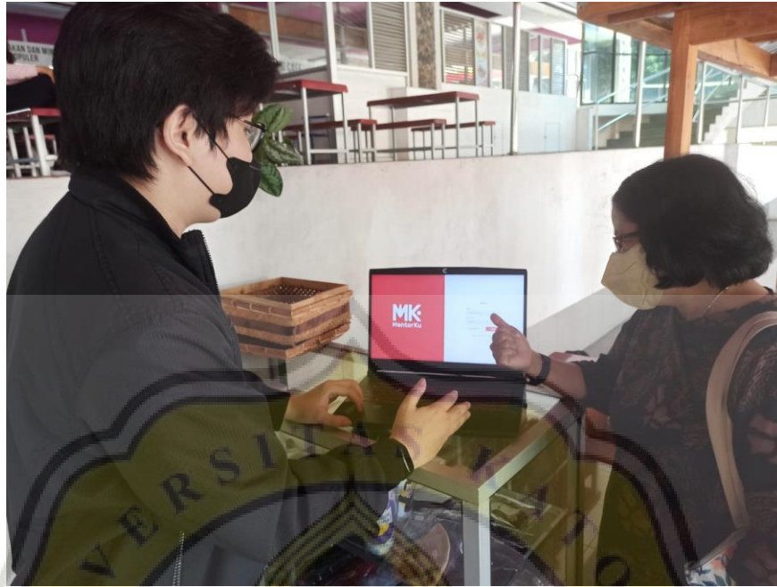
Gambar B.1 Dokumentasi Uji Coba Aplikasi MentorKu