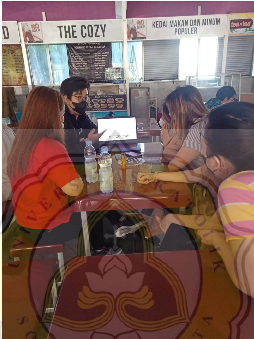
Gambar B.7 Dokumentasi Uji Coba Aplikasi MentorKu