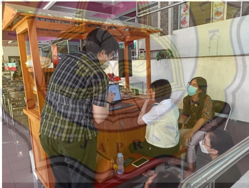
Gambar B.4 Dokumentasi Uji Coba Aplikasi MentorKu