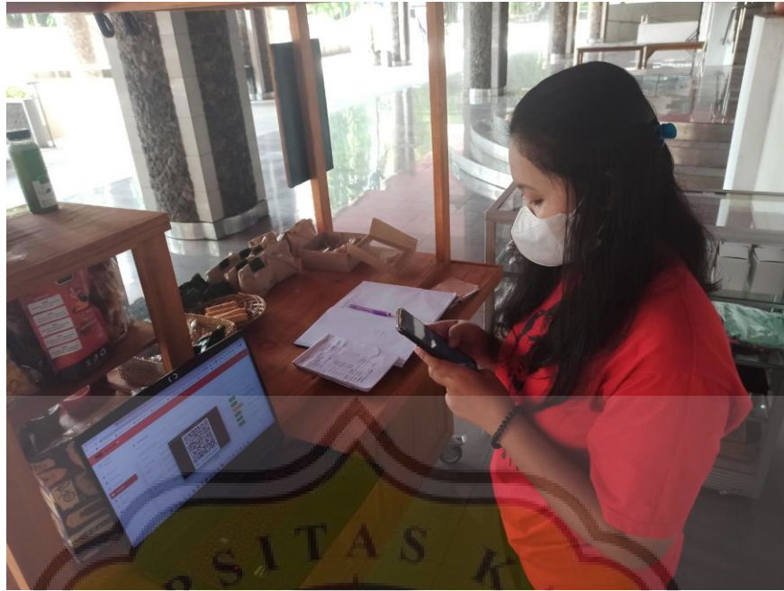
Gambar B.3 Dokumentasi Uji Coba Aplikasi MentorKu