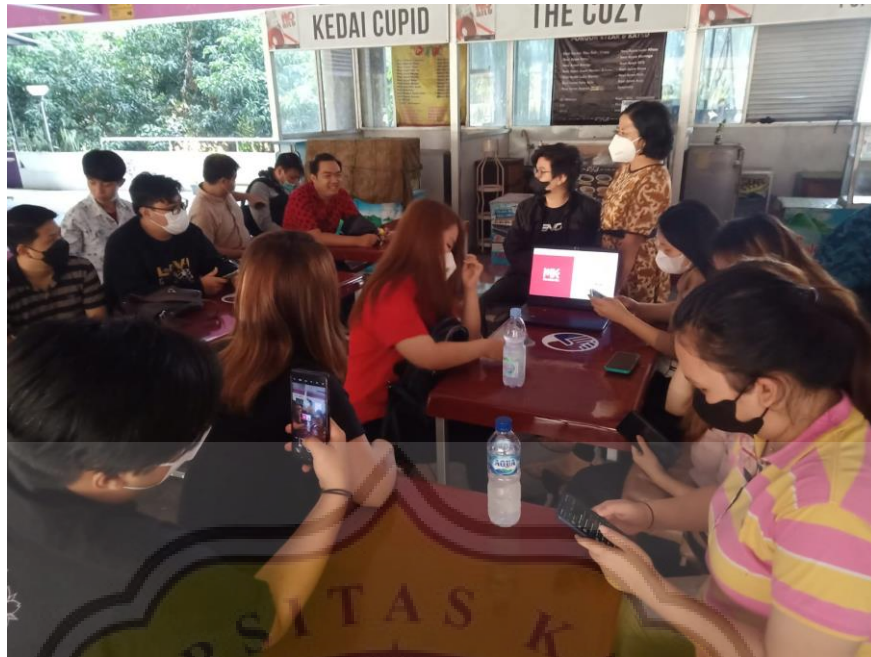
Gambar B.5 Dokumentasi Uji Coba Aplikasi MentorKu