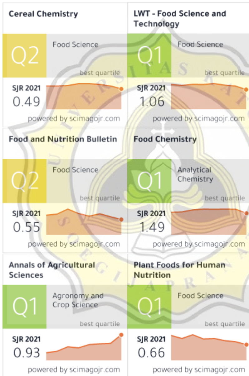
Lampiran 1. Journal Ranking