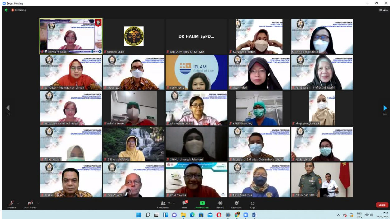
Sesi foto bersama.