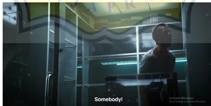
(Krieger, 2018, Ep. 2. min. 05:19)