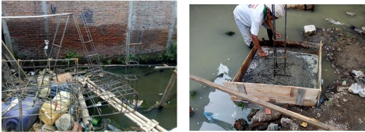
Figure 7: Casting of the raft foundation (left) and Ironing of the column (right)