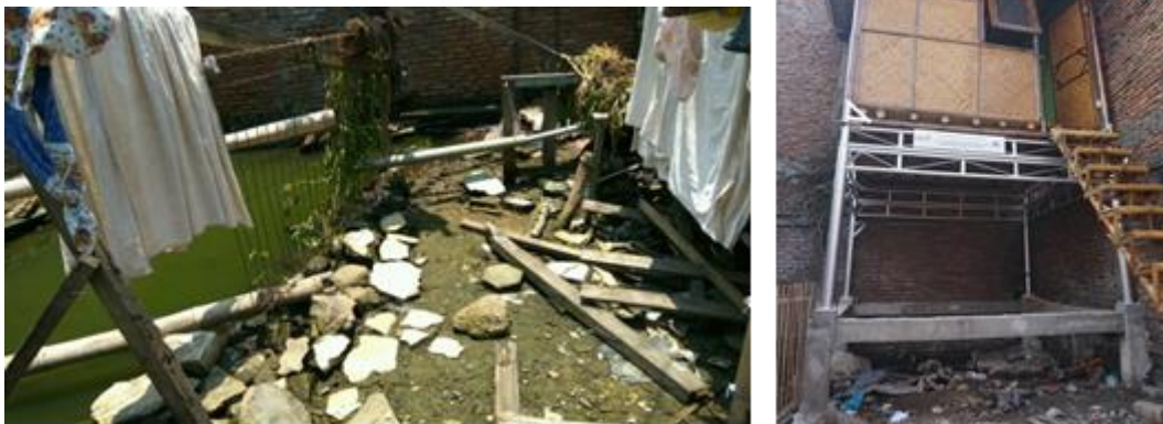
Figure 2: the land of Mr. Heriyanto's house before it was built (Left) and a hydraulic stage house that had already been finished (Right)

In making this stage house, foundation is the most important part to consider because it is located in an area with soft soil condition. The type of foundation used was raft foundation. Considering the condition of soil submerged by tidal water which is very soft soil, bamboo must be installed to provide additional land carrying capacity at the building site.