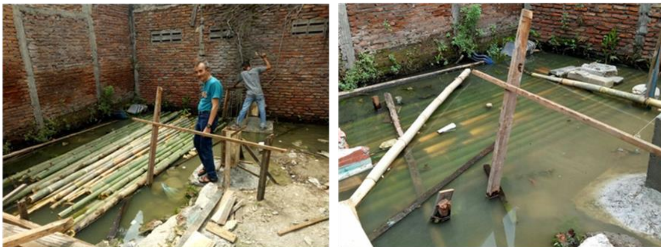
Figure 6: Preparation of bamboo immersion in tidal water (left) and Immersion for bamboo preservation in the location of the stage house (right)

For bamboo, preservation was carried out in order to prevent pest and fungus attacks. Bamboo contains flour which is preferred by termites. For this reason, all parts of bamboo stems need to be immersed first in water so that the flour can dissolve and ultimately not be liked by termites. Soaking bamboo for preservation was done at the location of the stage house