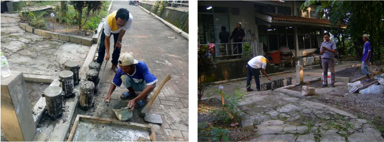
Figure 10: Mixing a concrete stir for a concrete cylinder test (left) and making a concrete test specimen (right)