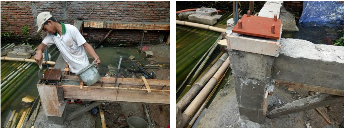
Figure 9: Casting of sloof beam and raft foundation column (left) and finished casting of sloof beam and raft foundation column (right)

The sloof beam of the stage houses was made of reinforced concrete with a cross section size of 15 x 25 cm with a reinforcement of 6 Ø 12 and a brace of Ø 8-15 which functions as a binding beam of the raft foundations. These can occur simultaneously.