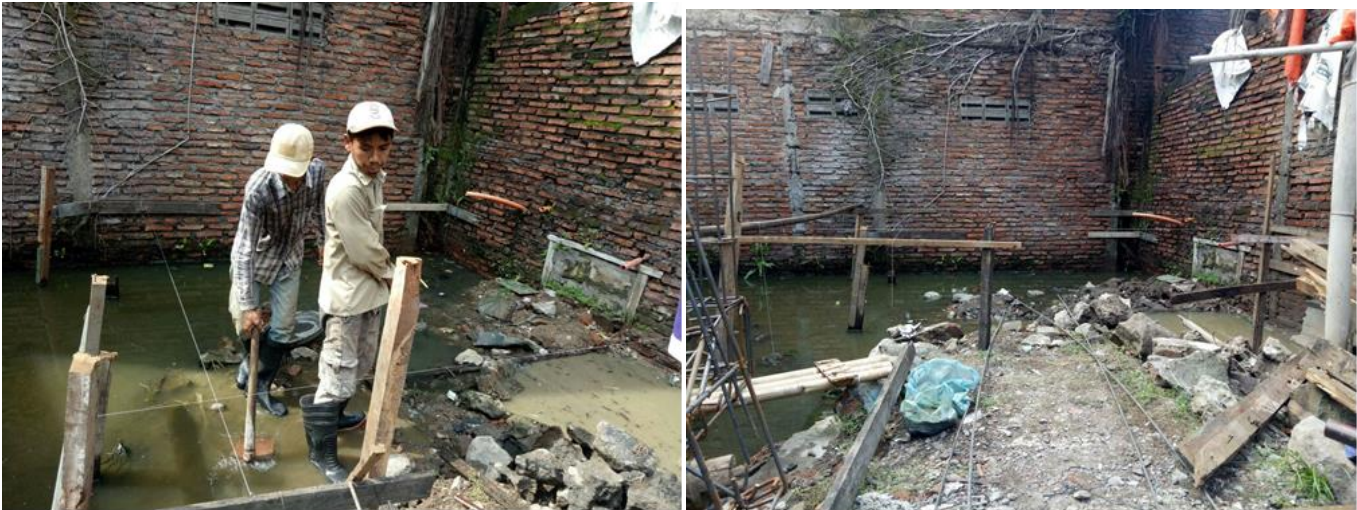
Figure 3: Work preparation (site clearing) (left) and Uitzet (measurement) building boundaries and bouwplank (right)

Before the erection of the bamboo, it was preceded by cleaning and uitzet or measurement and bouwplank work so that the spacing of columns or building boundaries to be carried out is really precise and truly in right angle.