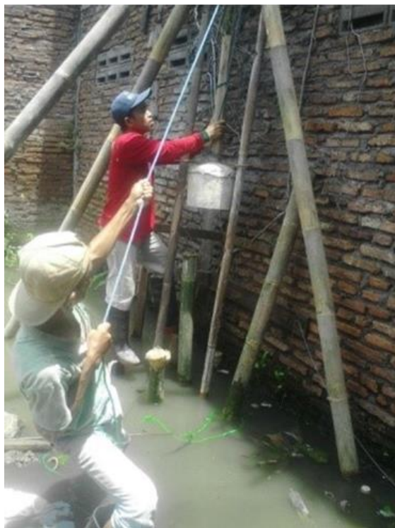
Figure 5: Stacking of bamboo pile at the stage house