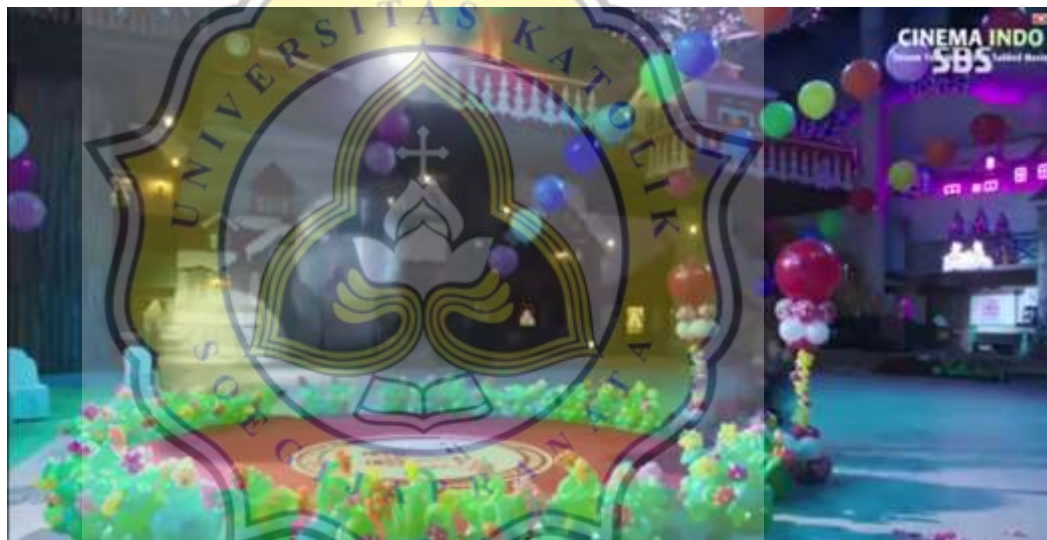
Episode 2 52:42 (Robin save Jang Ha Na from a falling venice lamp)

together. While in the pool, Robin is still hugging Jang Ha Na. Robin did this because Robin wants to make sure that Jang Ha Na was okay. Robin's superego in this scene is when Robin jumps from the hospital rooftop to saves Jang Ha Na. In this action, there is no guarantee that Robin can survive. We all know that the hospital's rooftop is very high, and Robin also jumps spontaneously. Robin is willing to risk his life to save others. This proves that Robin's id saves Jang Ha Na by jumping from the hospital rooftop even though it endangers his own life. Robin prioritizes others safety above his safety.