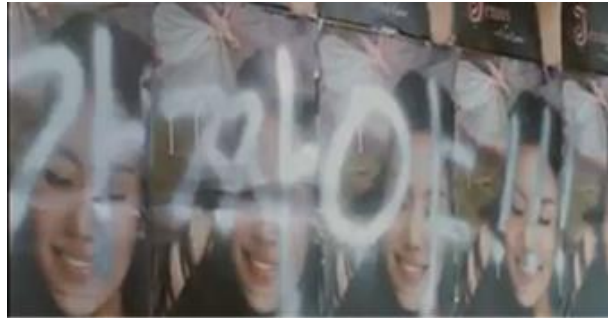
Figure 4.20 the second terror for Jenny