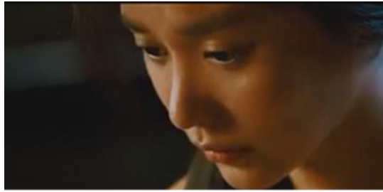
Figure 4.16 Jenny tries to forget her past