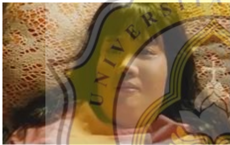
Figure 4.11 Hanna's old body