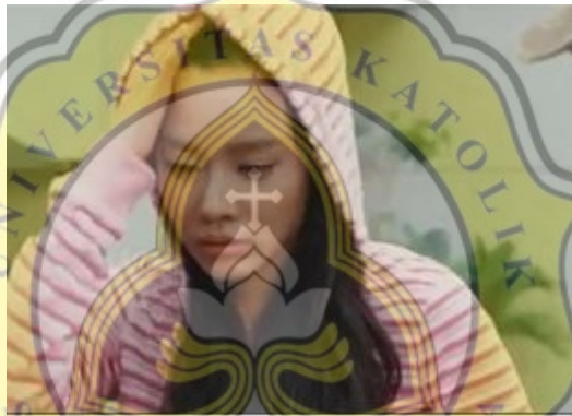
Figure 4.19 Jenny's facial expression when she gets the first terror