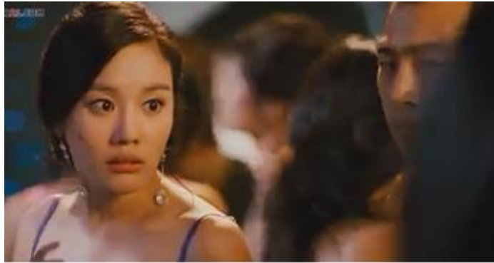
Figure 4.22 Jenny's facial expression when her father attends the party