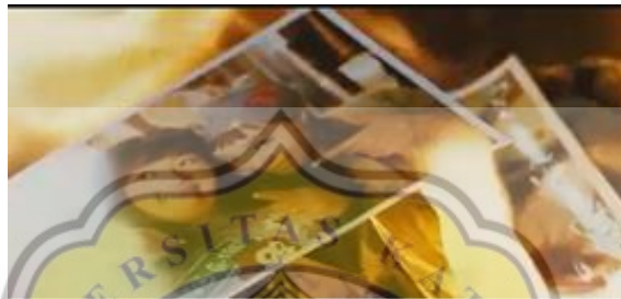
Figure 4.17 Jenny burns her past photos