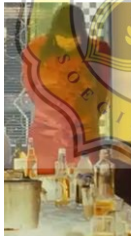
Figure 4.7 the red dress Hanna wears

Hanna follows the instructions stated in the letter. She wears a red dress and earrings for Hang Sang Jun's birthday party. When Hanna meets Hang Sang Jun at the birthday party, she tells him that she wears the dress because he gives it to her. Hang Sang Jun is really shocked by what Hanna says. It is because he never sends the red dress and earrings to Hanna.