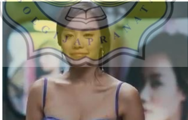
Figure 4.23 Jenny cries

Jenny is so shocked when she finds out that the fan Ammy tells her is Jenny's father. At that moment, her father wants to give her a doll. However, Jenny refuses it since she is afraid that her true identity will be revealed at the party whereas actually Hang Sang Jun has already known Jenny's real identity. Jenny, at the party, does not even admit that he is her father. She feels very afraid and also sad.