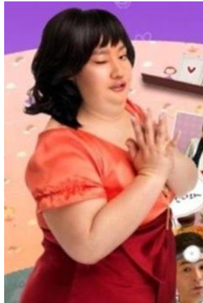
Figure 4.1 The character of Hanna