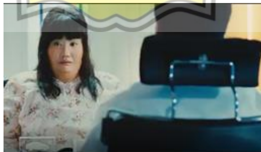
Figure 4.10 Hanna discusses plastic surgery