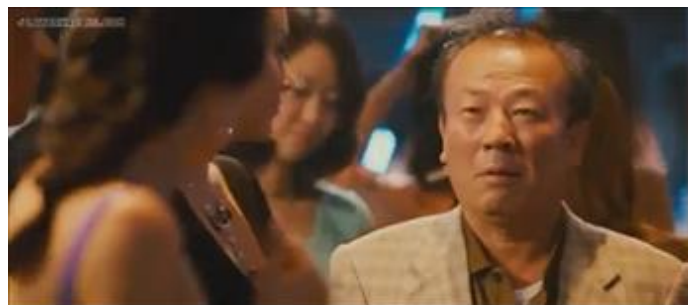
Figure 4.21 Jenny's father attends the party

The side effects of the plastic surgery that Hanna experienced are at its peak when she attends her album launch party in Hang Sang Jun's studio. At the party, Ammy congratulates Jenny on her album launch. Ammy says to Jenny that her fan attends the party and wants to meet her. That is Jenny's father who was treated in a psychiatric hospital.