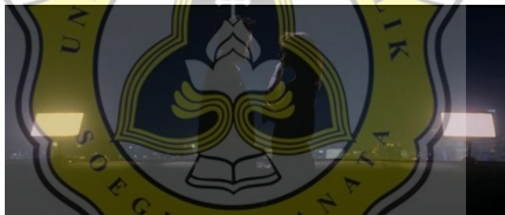
Picture 13 Constantine gives the Spear of Destiny to Angela and tells her to keep it (01:52:00)

Dedication is loyalty and commitment to the interest of your life or for other people. The hero is the man dedicated to the creation or defence of reality conforming, life-promoting values (Farley, 2011, p. 10).