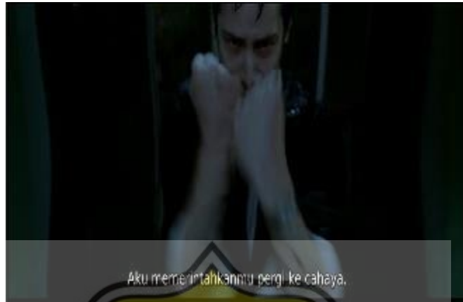
Picture 3 Bravery of Constantine when fighting Mammon the son of Satan ( 1:34:18)

the war, he still be brave in facing Mammon face to face. It can be seen in the picture below: