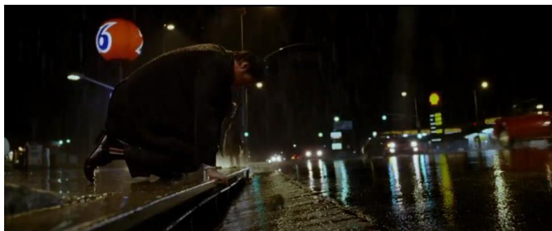
Picture 12 Constantine has severe cough because he suffered terminally lung disease (00:27:57)

Steadfastness is suffering without complaining (Farley, 2011, p. 10). A hero should be steadfast to fasten his life that is full of struggle.