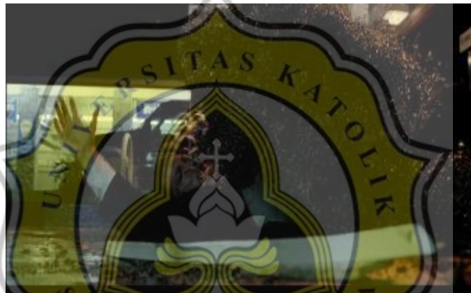
Picture 2 Bravery of Constantine when he fights the demon ( 00:28:28)

When Constantine in the way back to his home, he was assaulted by the demons soldier in the form of bees. The demon soldier started to be brave to attack him even though the light street on and the street is crowded. The soldier even can take him down to the ground almost put Constantine life in danger. It can be seen in the picture below: