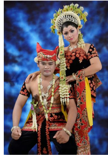
East Javanese Wedding