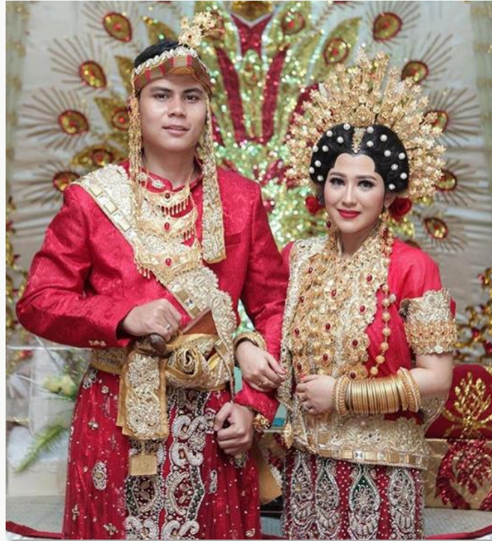
Makassar (South Sulawesi)