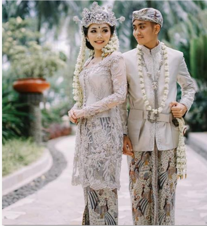
Sundanese (West Java)