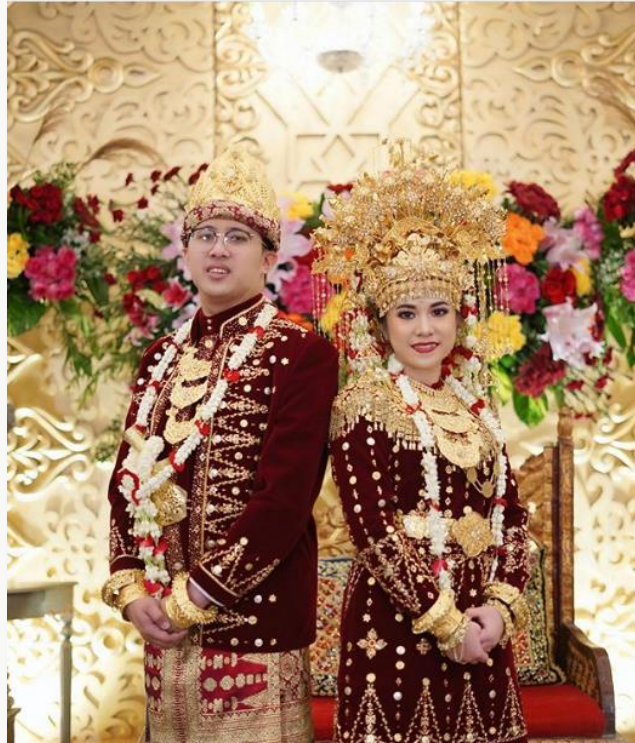
Palembang (South Sumatra)