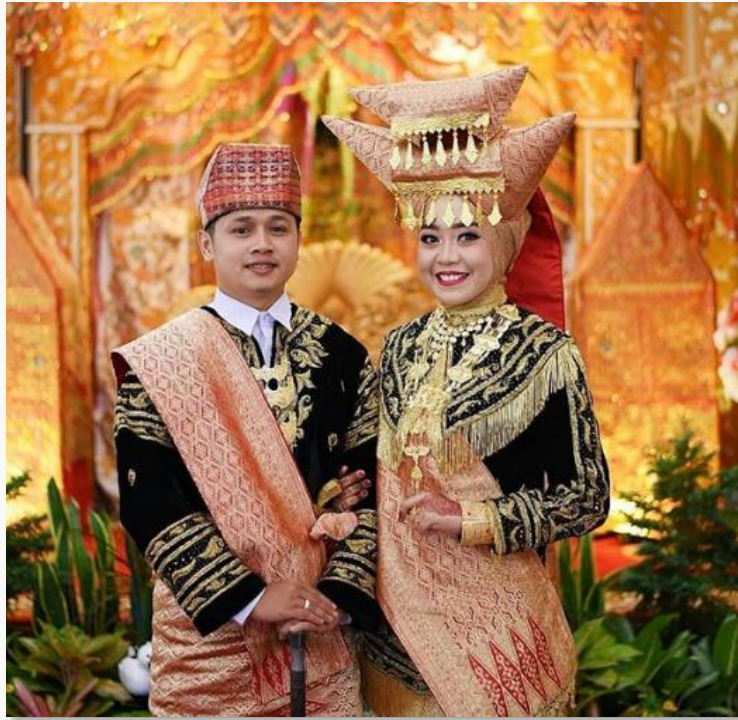
Minangkabau (West Sumatra)