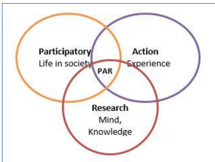
Fig 1. Participatory Action Research [15].

This article uses a participatory action research, which is a collaborative research that equitably involve all partners, i.e student, teacher, and elected small medium enterprise. Participatory action research uses result of research to participate in society's life. Participant do an action through an engagement with experience. Figure 1 showing that participatory action research builds the society by implementing research result in the form of actual action.