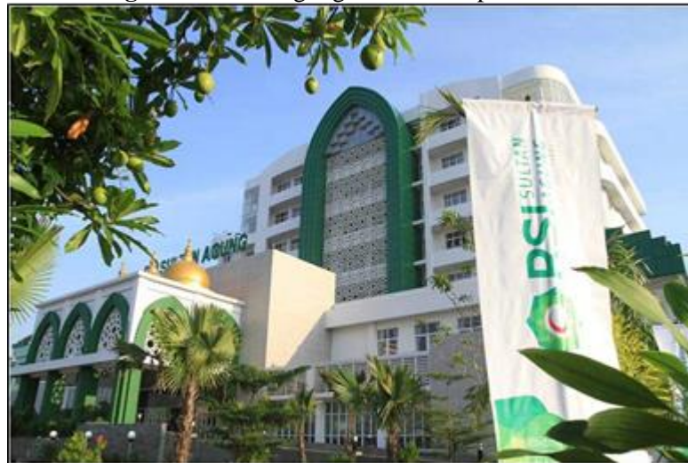
Figure 2 Sultan Agung Islamic Hospital

On July 16, 2014, Sultan Agung Islamic Hospital was declared as a completely accredited hospital by Hospital Accreditation Committee (KARS). Although it has grown to be a big hospital, Sultan Agung Islamic Hospital remains as a religious values based hospital with clear missions, namely to organize health care in the spirit of loving Allah and human beings, to organize education for building khaira ummah generation and to build Islamic civilization towards prosperous society blessed by Allah.