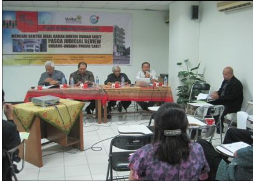
Figure 1. Seminar Discussion

These provisions could be interpreted that the establishment of a government's hospital (especially regional hospital) should be based on the provisions stipulated by the Government Regulation number 41 of 2007 about Regional Apparatus. Meanwhile, if the organizer is a private agency there should be a legal entity conducting business activities in the field of hospital.