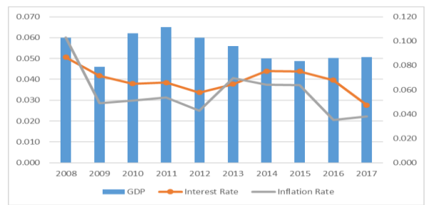
Figure 1 . Market Information

This study provides an overview of investment strategies that are often used by scholars is a top down analysis. Therefore, researchers provide a macroeconomic picture that directly impacts the capital market to individual investors. Macroeconomic data shown are GDP, inflation, and interest rate. Then, given industry information that can be seen virtually with technical analysis. Furthermore, the performance of companies that want to be purchased such as Price Book Value (PBV), Return on Assets (ROA), Return on Equity (ROE), and undervalues or overvalues of Price Earnings Ratio (PER).