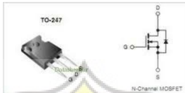
Gambar 3 Mosfet IRFP 460