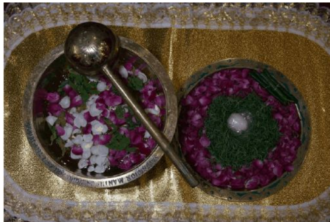
Picture 37. Properties of panggih

This sindur cloth is used to cover the couple's shoulders after panggih ceremony.