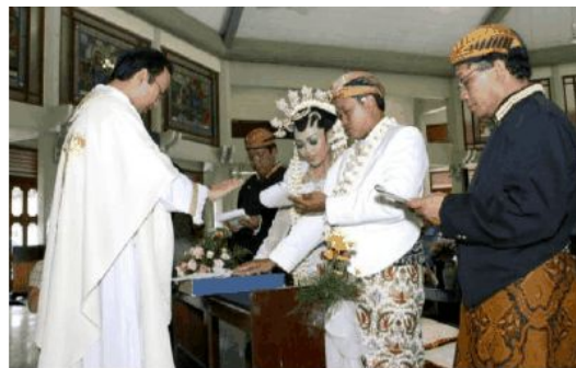
Picture 36. Upacara pemberkatan pernikahan

It makes the marriage official through marriage sacrament (Christian) or ijab for moslem. In moslem way, this covenant is guided by a village chief. Meanwhile, in Christian way, it is guided by a priest. In this covenant ceremony, there is no custom ceremony, only based on regulations of each religion.