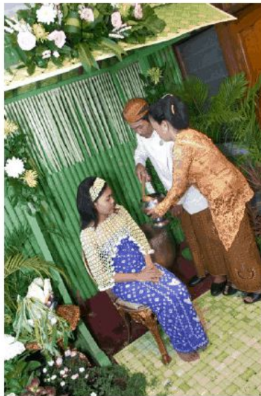
Picture 15. Takes a little water and pours them into bokor