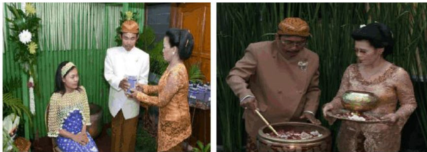
Picture 14. Mixes seven water