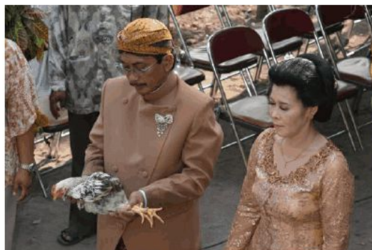
Picture 21. Bur-buran ceremony

j. Next process is bur – buran which is a process of releasing a prisoned cock so that it can be arrested by everyone.