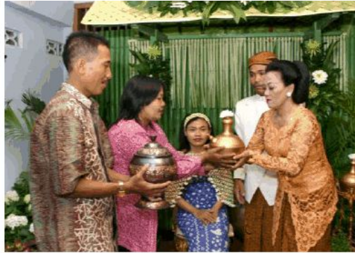
Picture 16. Give siraman water