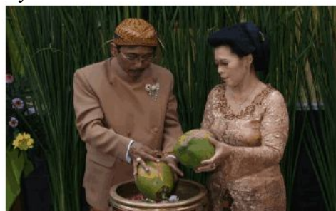
Picture 11. Gading coconuts