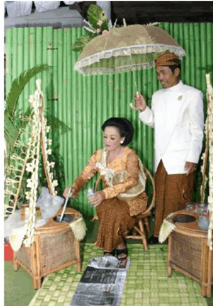
Picture 27. Decoration dodol dawet ceremony