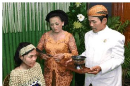
Picture 19. Father cuts his daughter's hair