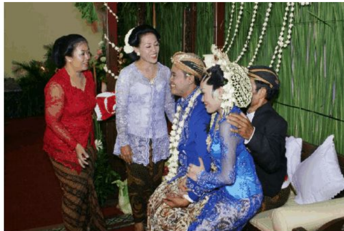
Picture 44. Nimbang ceremony

The bride's mother sits in front of them and asks her husband about the weight of the couple. He will say that their weights are just the same.