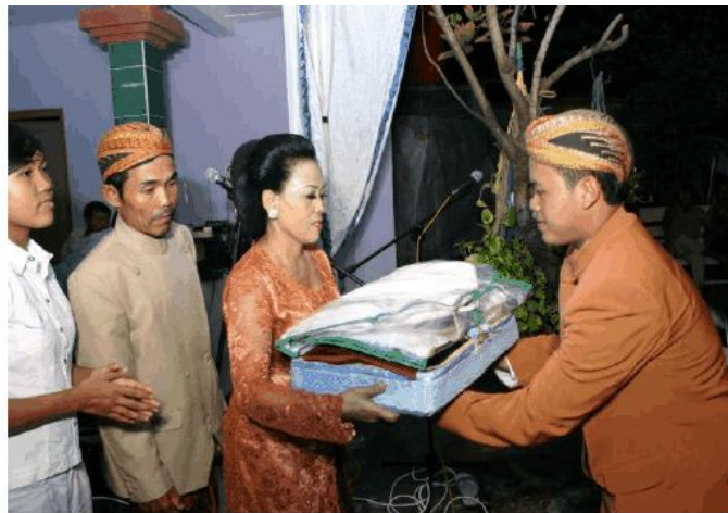
Picture 34. Giving paningset

highness clothes with a keris . The groom's keris consists of wilah , warangka , pendhok , and kolong kembang (fresh jasmine garland that slings over keris ). This keris means heirloom to keep safety and as a key of match. Besides that, the bride's mother also gives him gift. After this event is accomplished, it continues with majemukan .