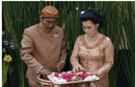
Picture 10. Telon flowers