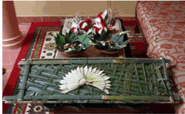
Picture 1. Maintenance Tarub implementation