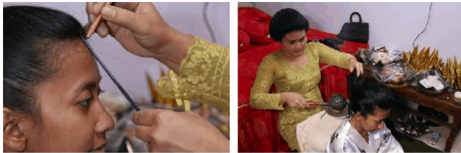
Gambar 22. Upacara ngarik

All things and food are set on tampah or nyiru or baki layered by banana leaf, its top covered by the small sindur cloth ( letrek ).