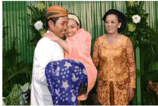
Picture 18. the bride is carried by her father