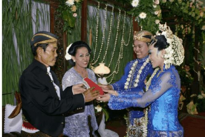
Picture 47. sindur that contains kacar-kucur is submitted to the bride's mother

Panggih ceremony in Yogyakartaese marriage custom shows some differences, they are: