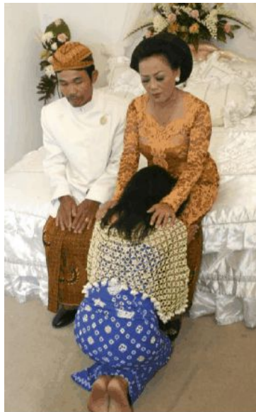
Picture 14. The bride does sungkeman to her parents