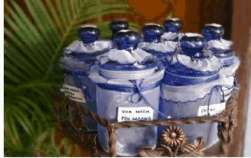
Picture 9. Seven water