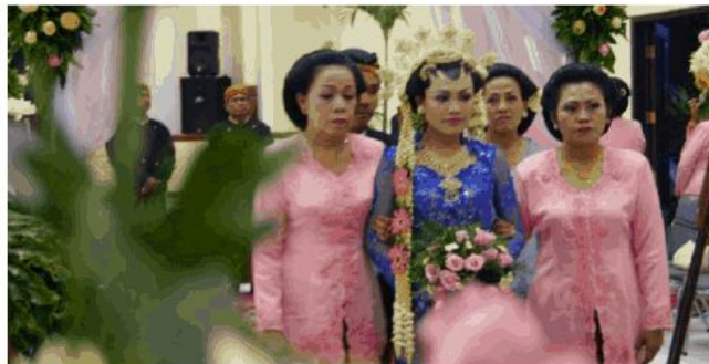
Picture 39. Panggih ceremony