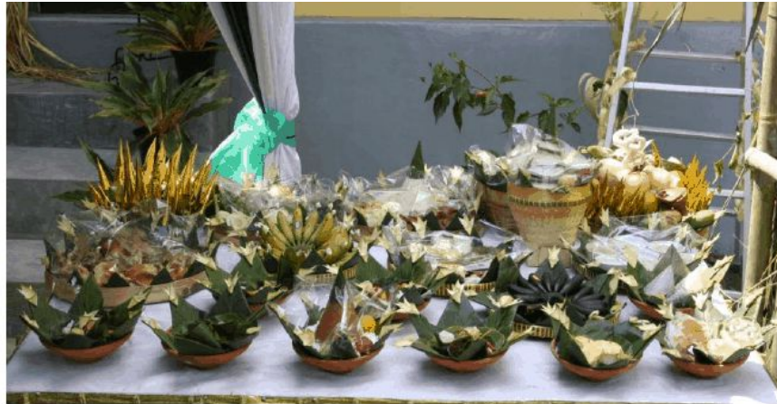
Picture 7. Many kinds of meals prepared for Tarub implementation ceremonial

As Yogyakartaese marriage custom, equipments for ceremonial meal in tarub setting are: