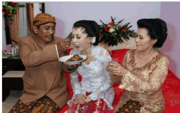
Picture 25. Dulangan ceremony