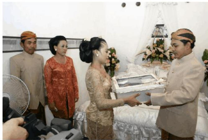
Picture 54. The bride giving gift for broter