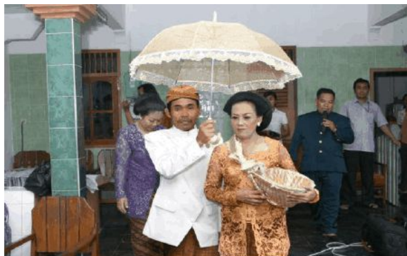
Picture 26. Prepare dodol dawet ceremony

Dodol dawet ceremony is only done in Solonese marriage custom, which means selling cendol . This ceremony is done by the bride's mother, covered by the father that takes place in front of the house or beside it. The guests buy the dawet using kreweng or broken roof-tile instead of real money. The money from that sale are collected and put into small pouch named kandi , then it is kept in pendaringan or a place to keep hulled rice. This process happens at 12 at mid day. The sun is highly rising, represents of development. This process creates intimacy and hospitality among the guests. Dawet represents kemruwet or crowded. It contains hope for the maximal total of guests in the wedding party.