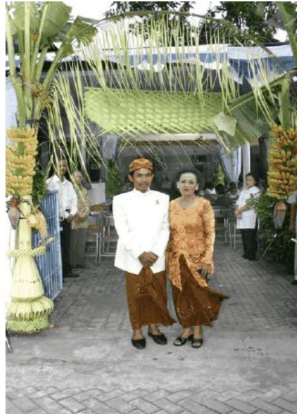
Picture 6. Decoration tuwuhan and tarub

In tarub implementation, there are meals used for ceremonial meal. These meals will be eaten by all guests and relatives in the house. These meals are prepared and made before setting tarub for Solonese marriage custom, which consist of: