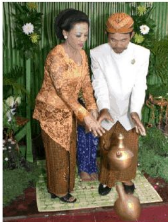
Picture 17. Breaks kendi