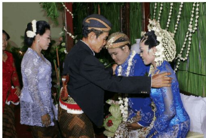
Picture 45. Nandur ceremony