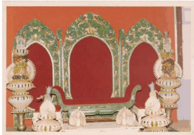
Picture 30. Kembang mayang