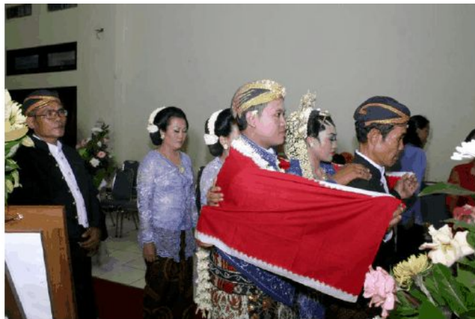
Picture 42. Singkepan sindur