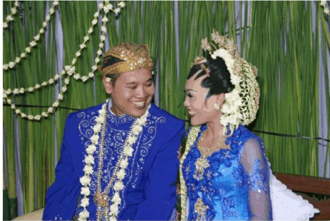
Picture 43. The couple will sit side by side