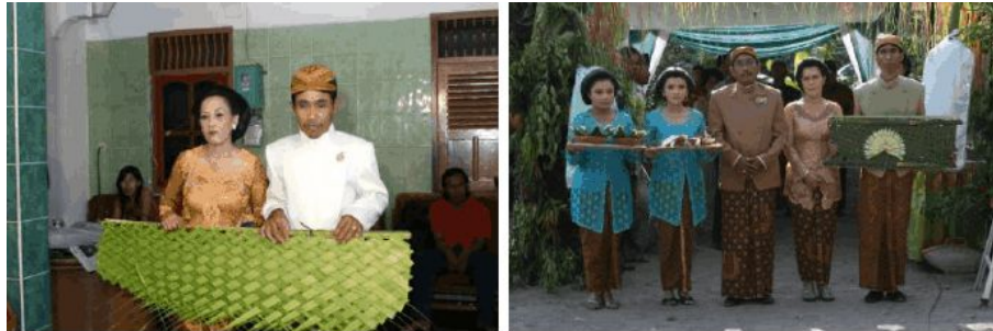
Picture 4. Prepare tuwuhan implementation

All goods are used in traditional event which is symbolic, full of phylosophy and proverbs, message, and hope of wealthy life.