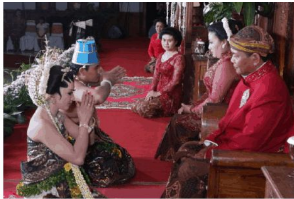
Picture 50. The bride and the groom do sungkem to their parents