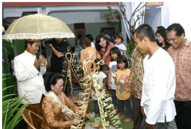
Picture 28. Represents dodol dawet ceremony