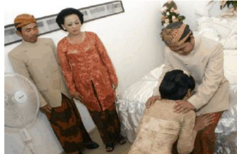
Picture 53. The bride sungkem