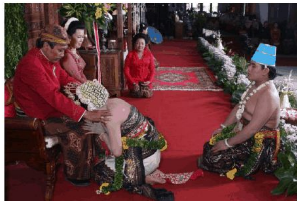
Picture 51. The bride and the groom do sungkem to their parents