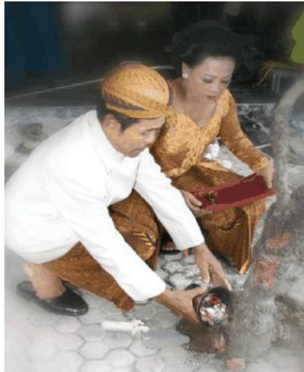
Picture 20. Planted hair in front of the house

j. Next process is bur – buran which is a process of releasing a prisoned cock so that it can be arrested by everyone.