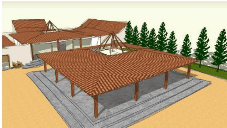
Picture 57. Javanese achitecture

In the past, an area of javanese tradittional houses is spacious and has a very wide courtyard. Javanese traditional house is similar to balinese traditional house. They have blocks of arrangement as follows :