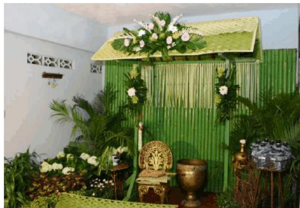
Picture 9. Decoration of siraman

Siraman is bath ceremony for the bride and the groom which means clean or sanctify, so that they are clean in body and soul when marriage covenant is held. Siraman ceremony is held a day before marriage and happens at 11 a.m.