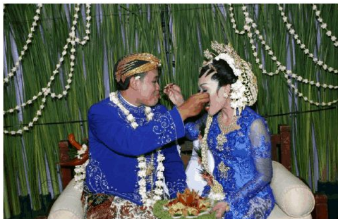
Picture 49. Given rice to his wife, and otherwise

Panggih ceremony in Yogyakartaese marriage custom shows some differences, they are: