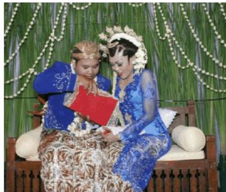
Picture 46. Kacar-kucur ceremony

After this ceremony ends, sindur that contains kacar-kucur is submitted to the bride's mother.