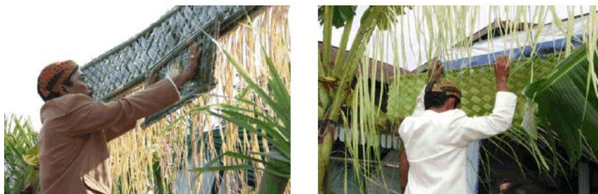
Picture 3. Tarub implementation