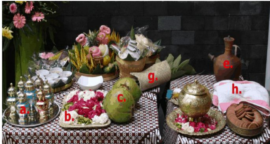
Picture 13. Equipments for siraman

Before siraman ceremony starts, there are meals that are provided as an introduction to prayer, they are: