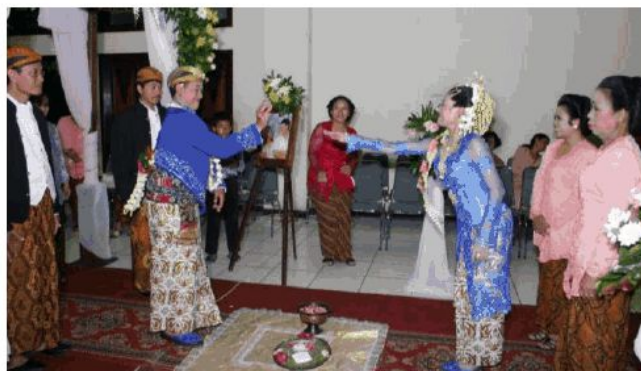
Picture 40. Throw gantalan sirih