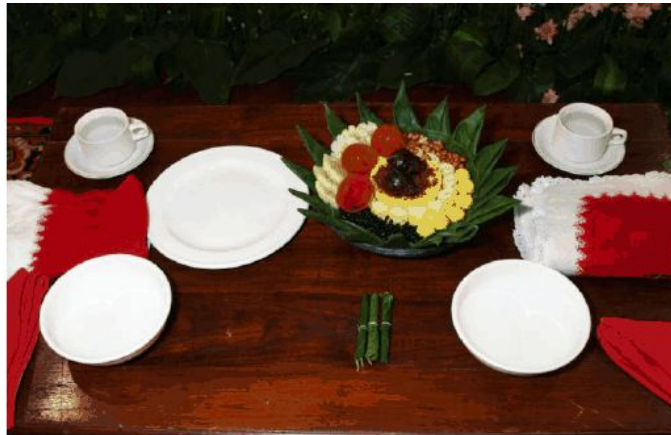
Picture 48. Punar rice