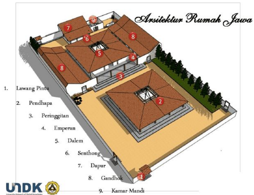
Picture 59. Javanese Traditional House Architecture

Javanese traditional house architecture, setting are :