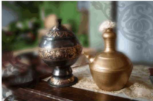
Picture 12. Kendi