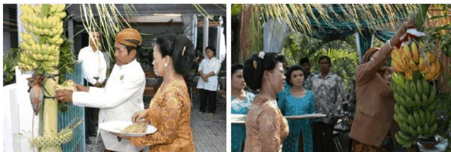
Picture 5. Processing tuwuhan implementation