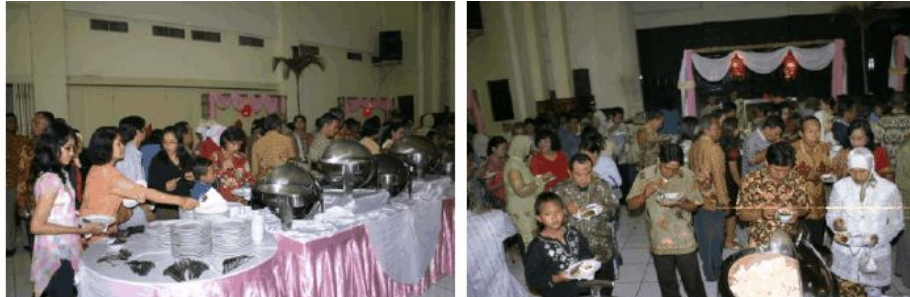
Picture 52. Reception