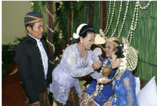
Picture 56. Bubak kawah ceremony