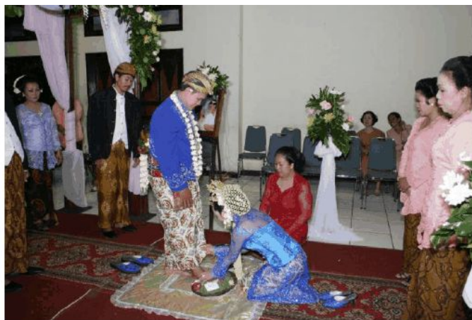
Picture 41. The bride will throw it to the groom's feet