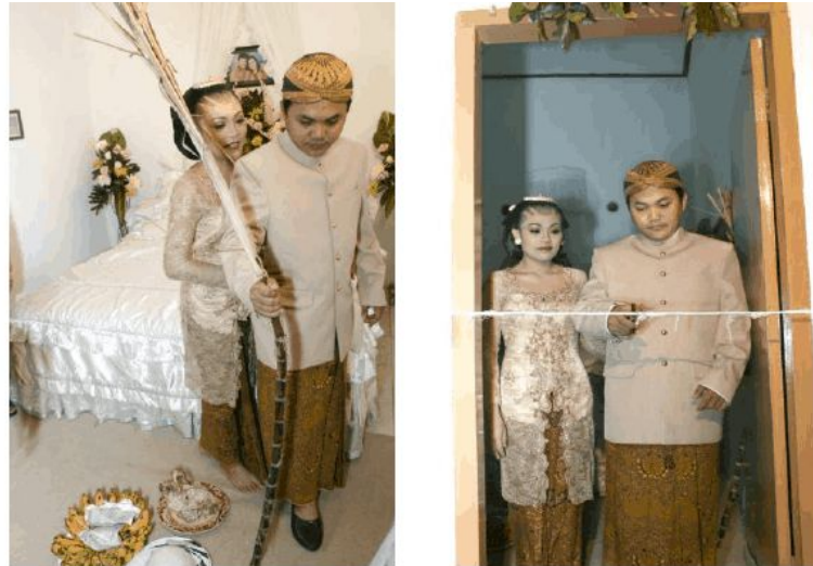
Picture 55. Langkahan ceremony