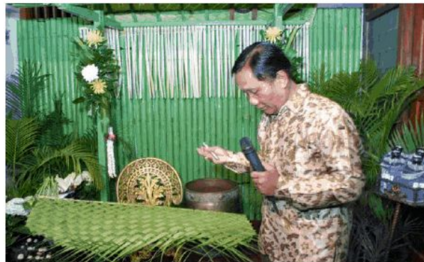
Picture 2. Pray before Tarub implementation