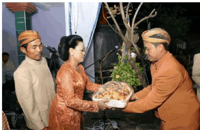
Picture 35. Giving gift