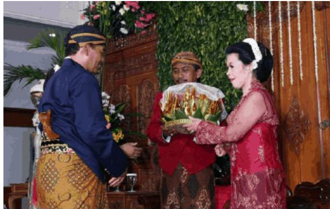
Picture 38. Bring sanggan